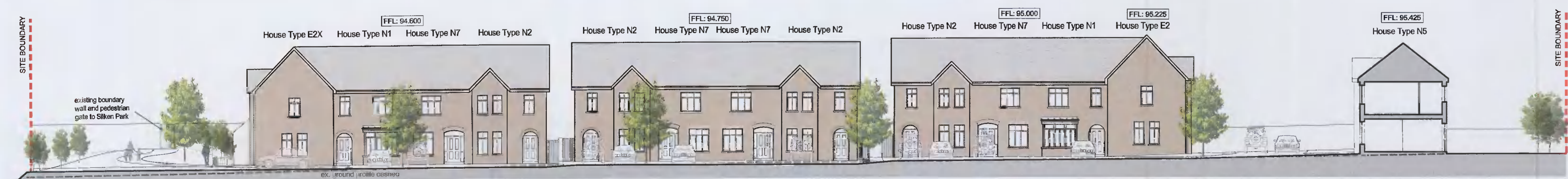
Site Section J-J