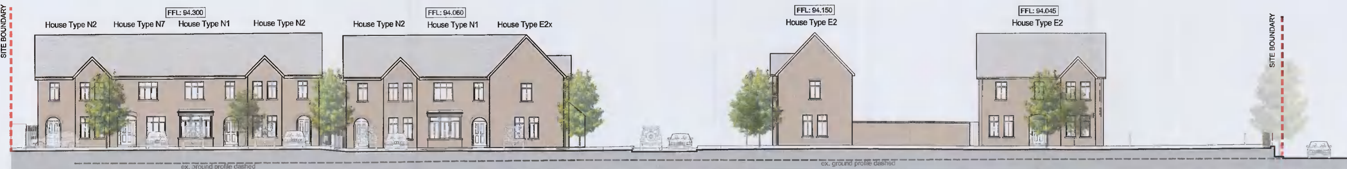
Site Elevation F-F