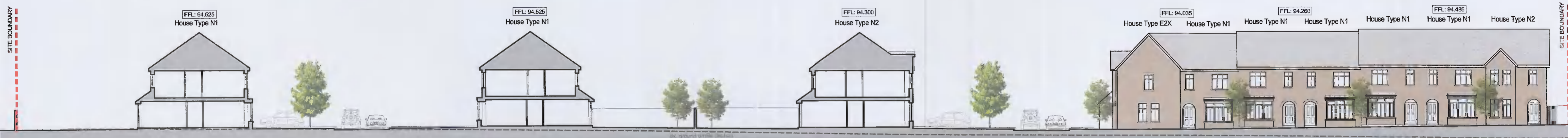
Site Section G-G

This drawing to be read in conjunction with Cunnane Stratton Reynolds Landscape Architects' Drawings.