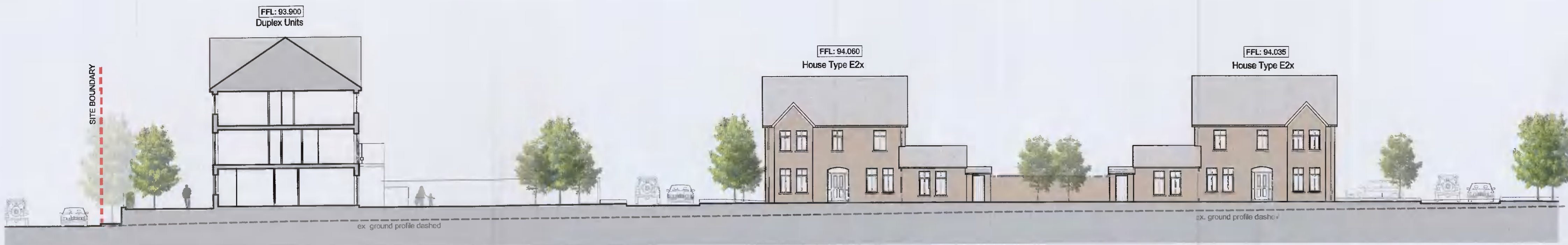
Site Elevation E-E