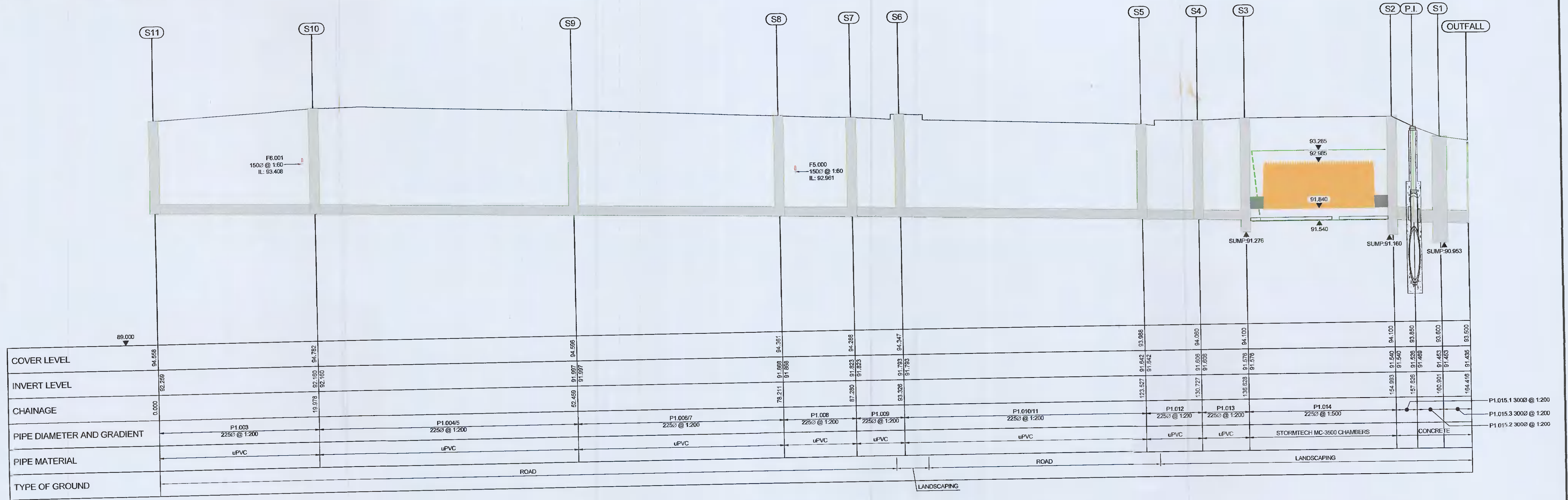
LONGITUDINAL DRAINAGE SECTION - S11 - OUTFALL SCALE: 1:250 H, 1:50 V