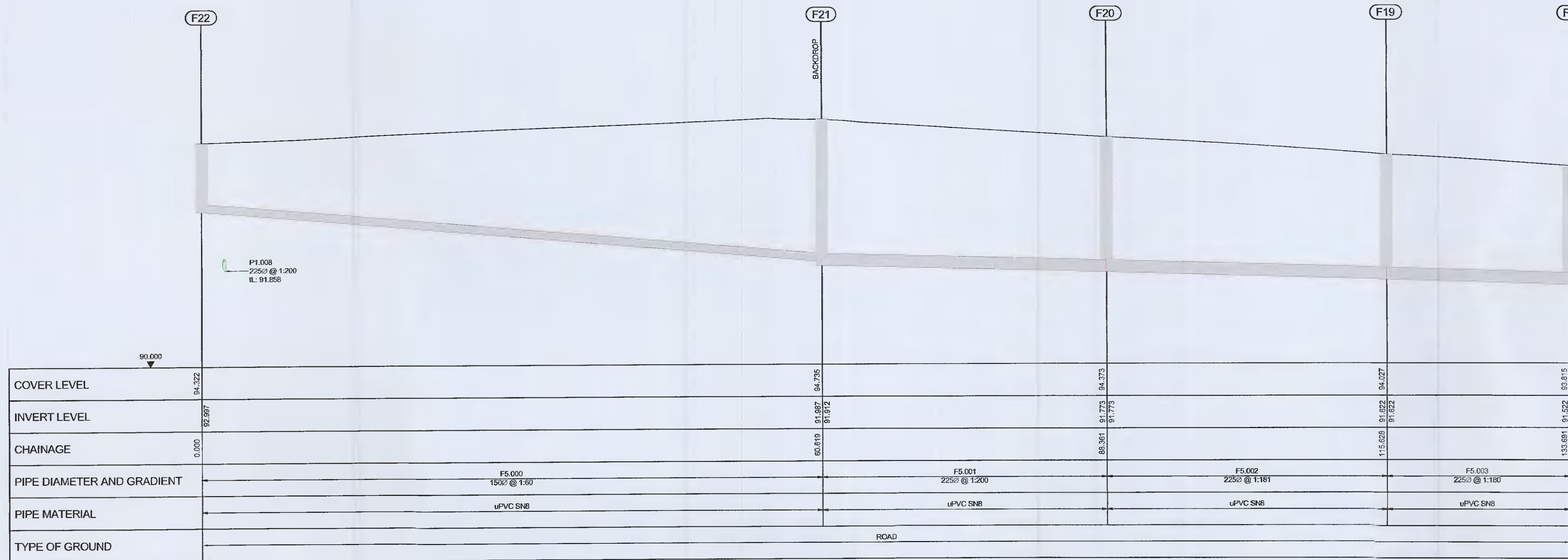
LONGITUDINAL DRAINAGE SECTION - F22 - F2 SCALE: 1:250 H, 1:50 V