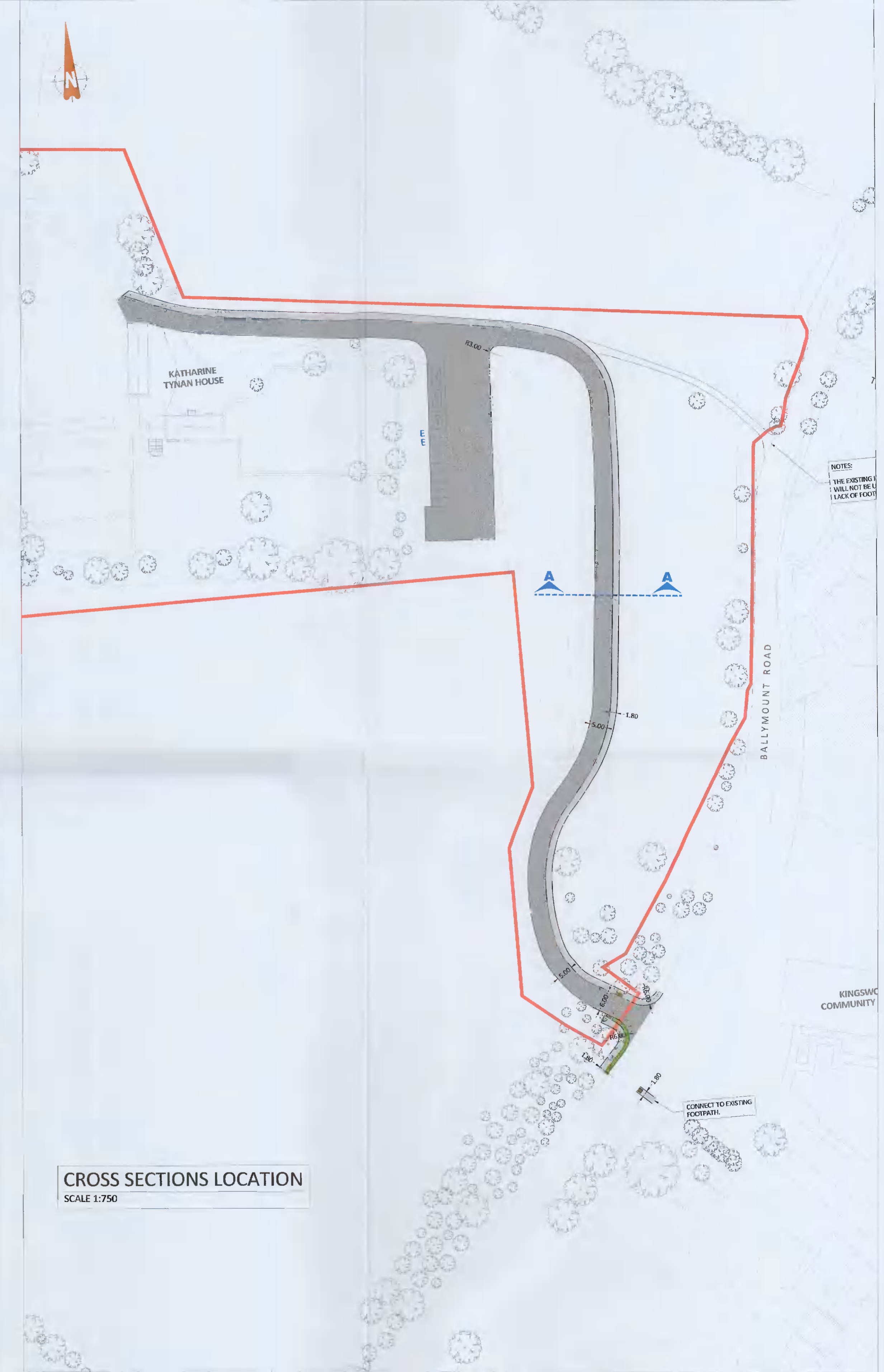
CROSS SECTIONS LOCATION SCALE 1:750

ORDNANCE SURVEY OF IRELAND LICENCE NO. EN000821 © GOVERNMENT OF IRELAND