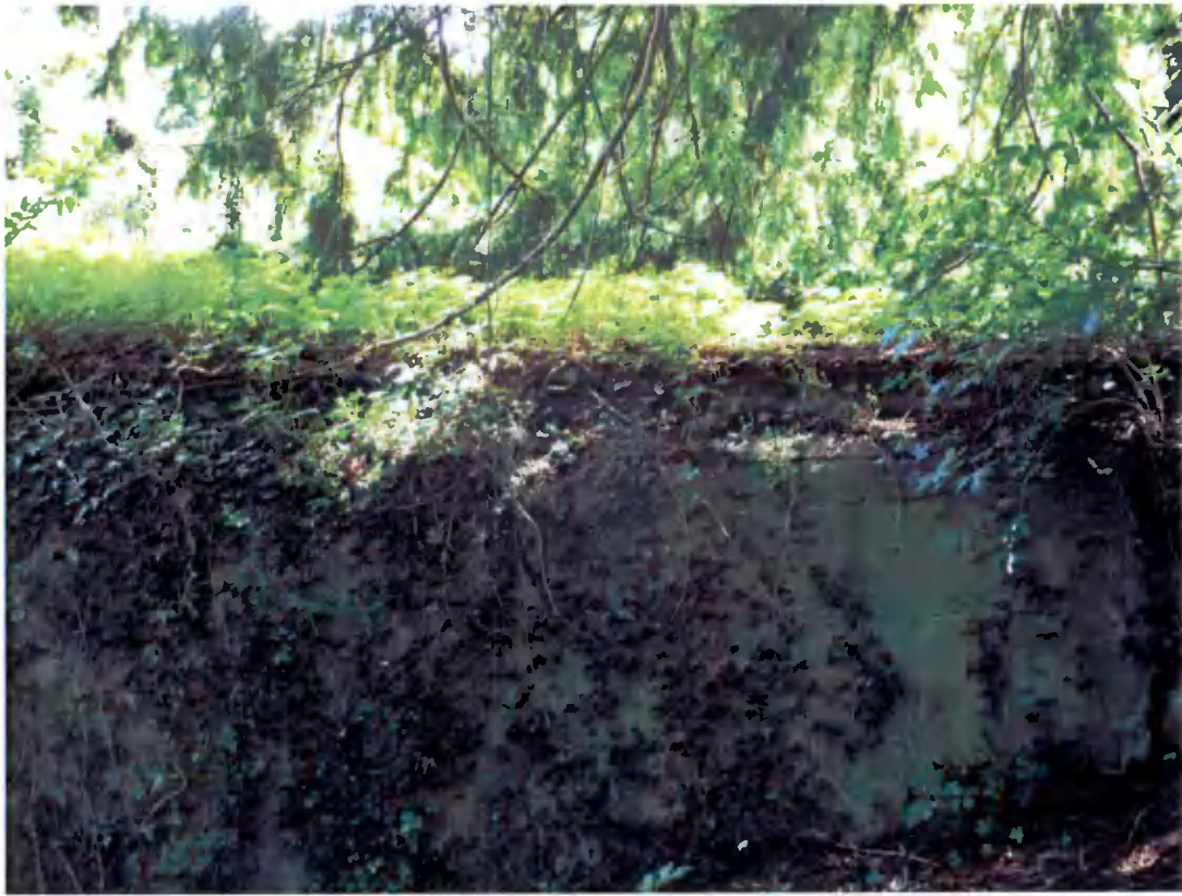
5 Cemetery wall seen from inside cemetery showing shed roof resting on top of wall