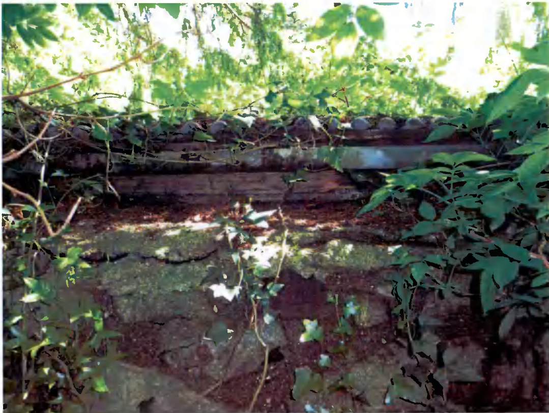
6 Detail of roof resting on top of wall, showing cement cap to wall