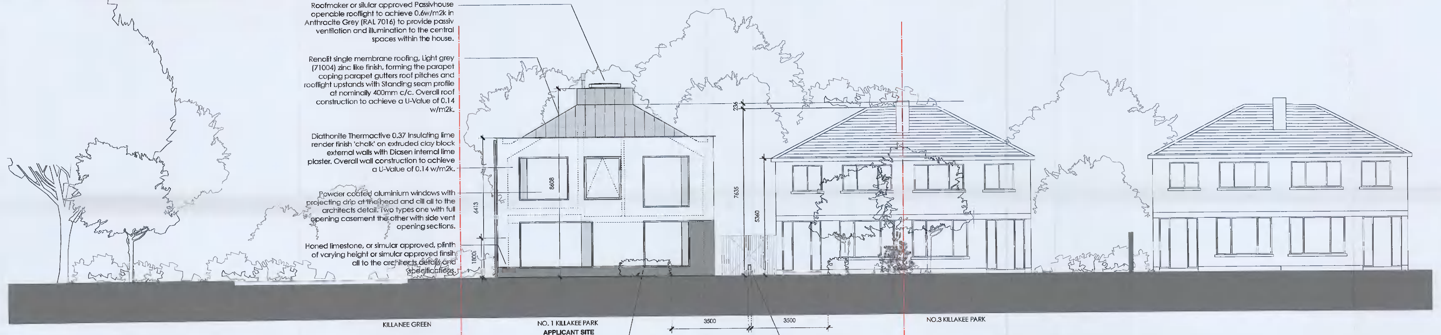
PROPOSED WEST ELEVATION (Front Garden) SCALE: 1=100 @A1