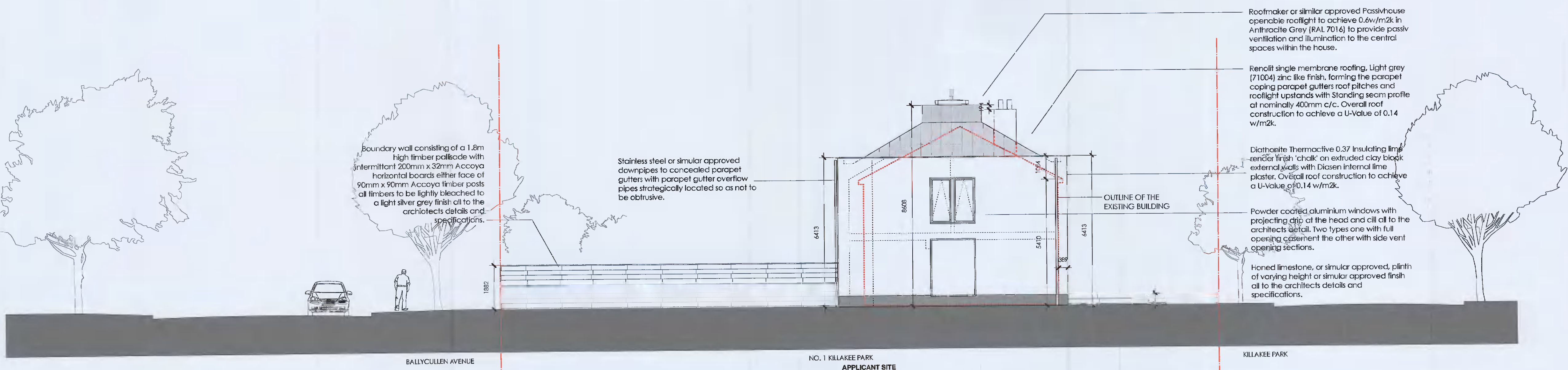
PROPOSED NORTH ELEVATION (To park) SCALE: 1=100 @A1