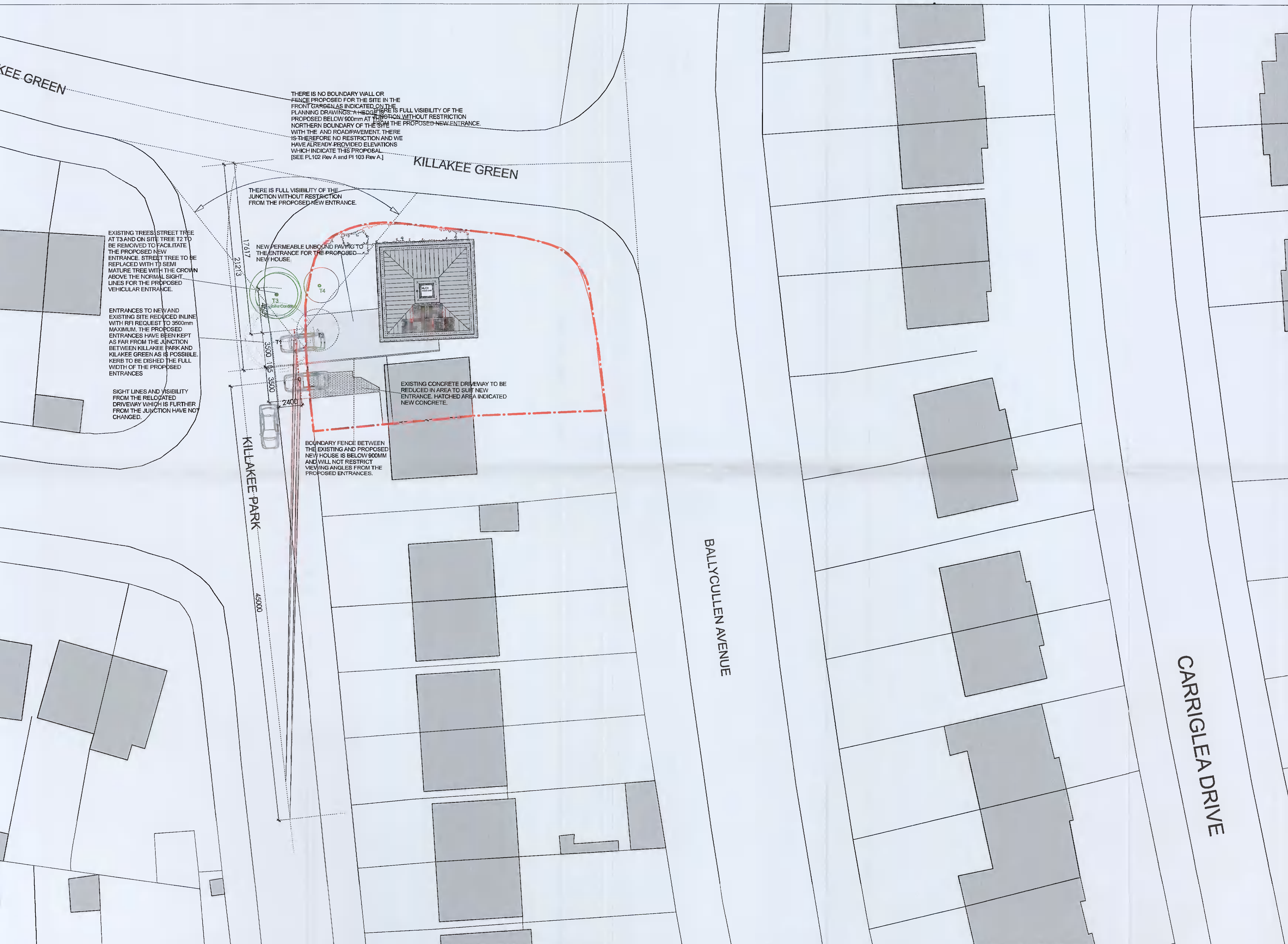
LOCATION AND TRAFFIC PLAN SCALE 1:200 MOVE THE EXISTING TREE T1 AND REPLACE AT T3