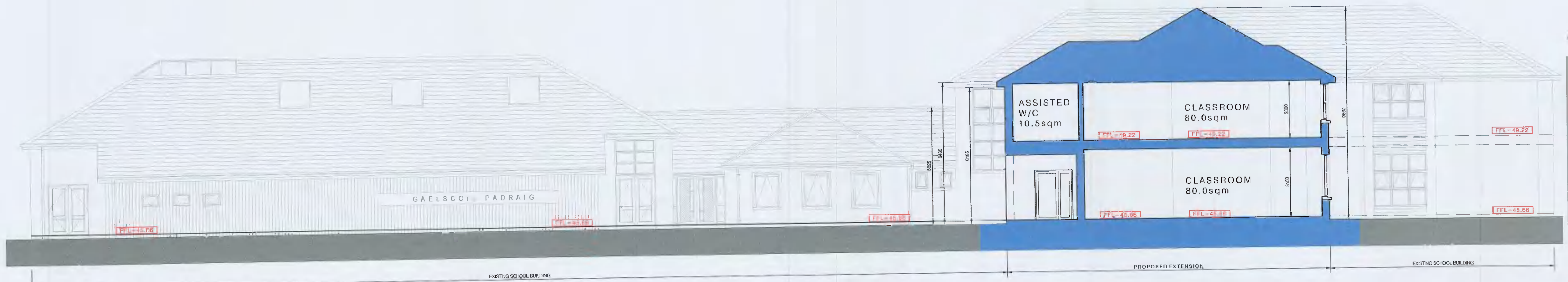
PROPOSED CROSS SECTION (REVISED DESIGN) SCALE 1:100