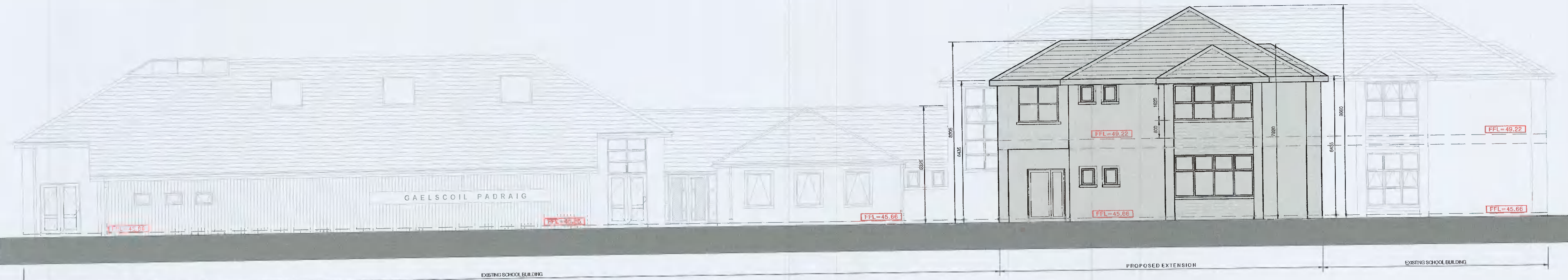
PROPOSED REVISED SOUTHEAST ELEVATION (FRONT) SCALE 1:100