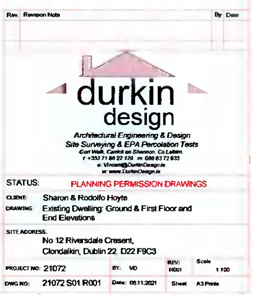
Existing GF Plan / Site Layout Scale 1:100