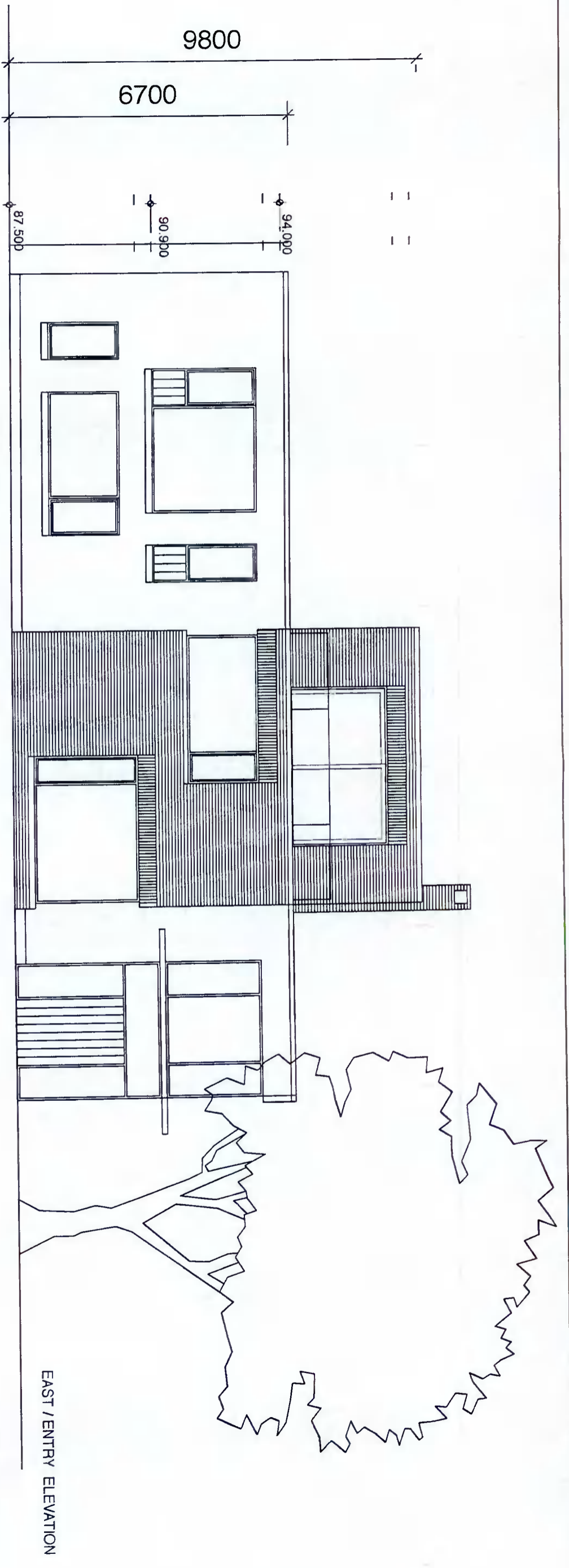
EAST / ENTRY ELEVATION