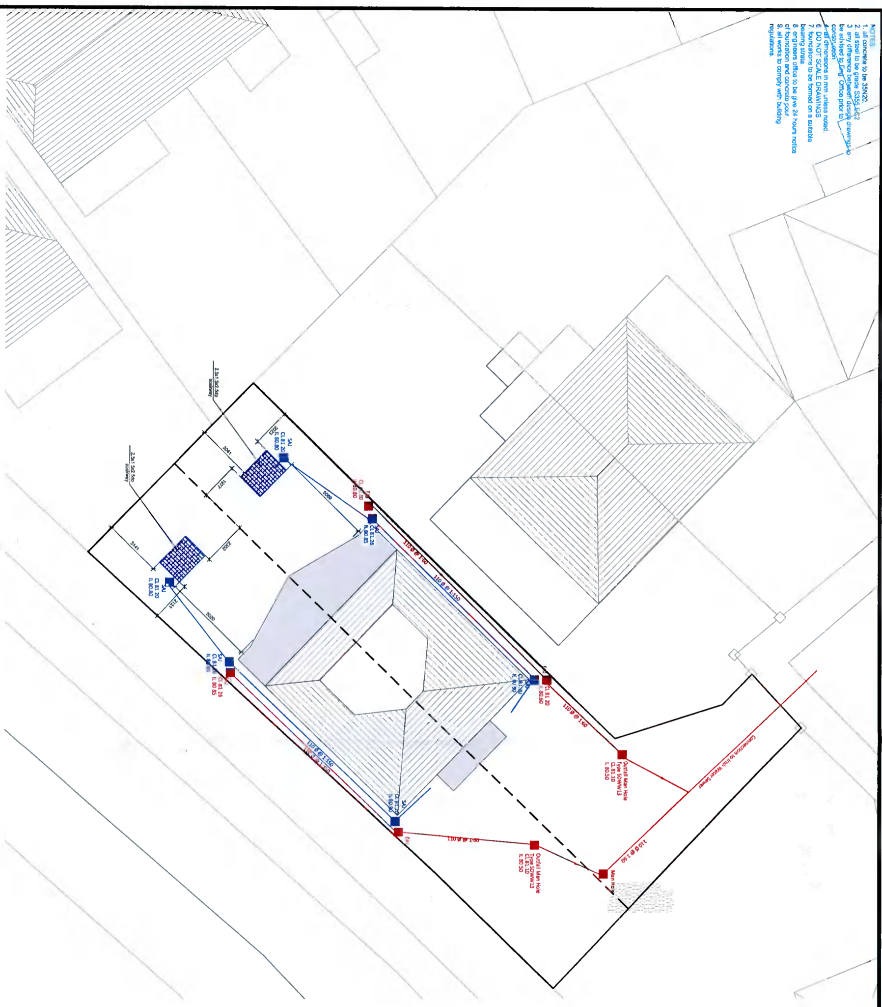
DRAINAGE LAYOUT 1:100