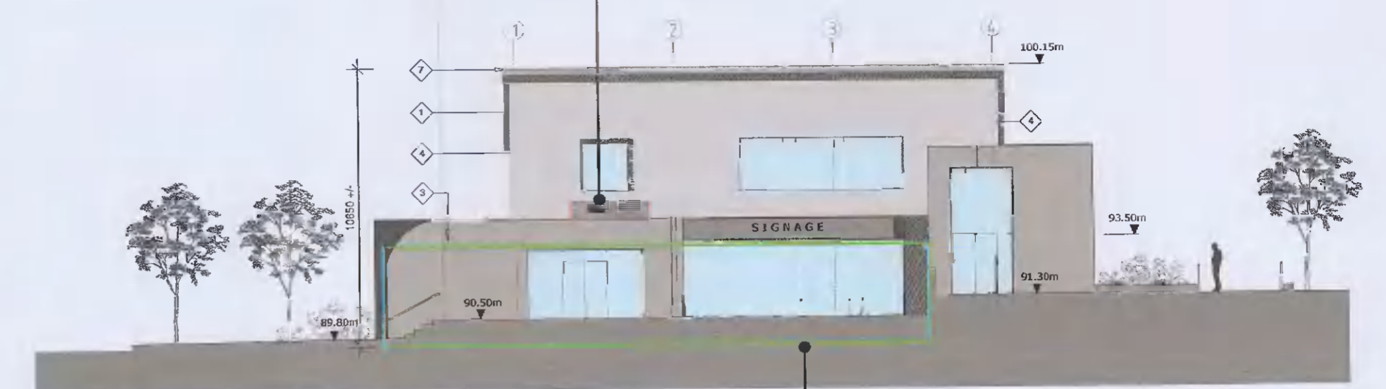
South Elevation - Contiguous Scale 1 : 200 @ A1

Plant with Louver screen partially concealed behind parapet