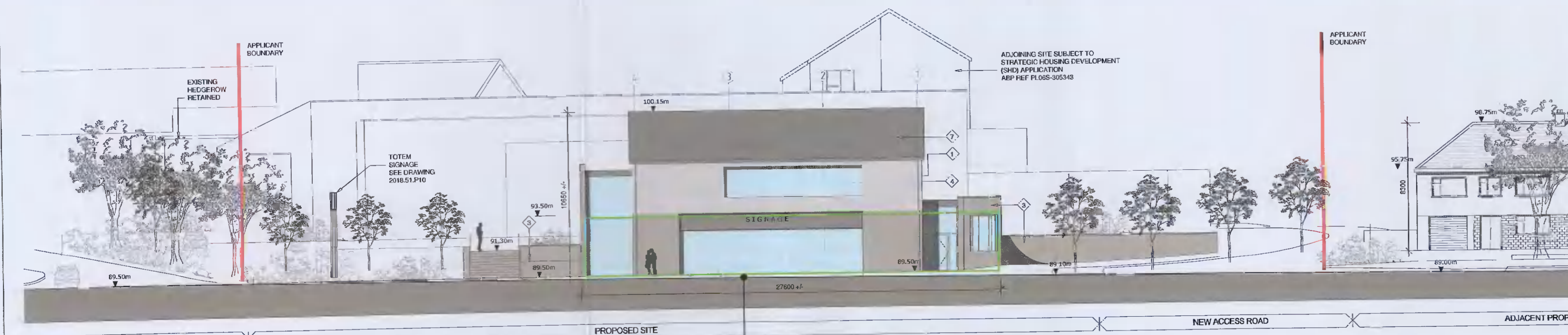
North Elevation - Contiguous Scale 1 : 200 @ A1

RETAIL UNIT Change of use from Cafe Unit to Pharmacy