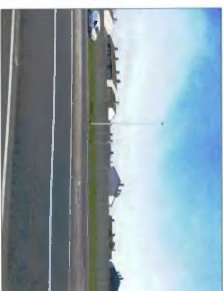
FIG. 1: EXISTING SITE ELEVATION