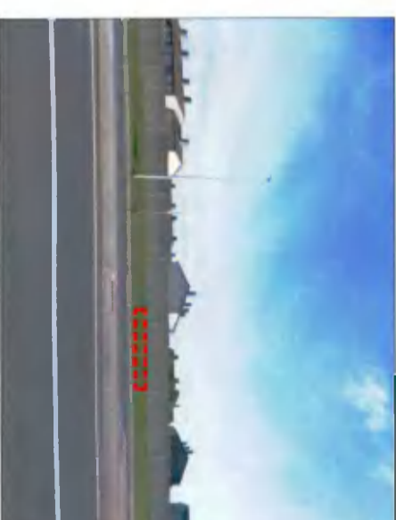
FIG. 2: PROPOSED SITE LOCATION