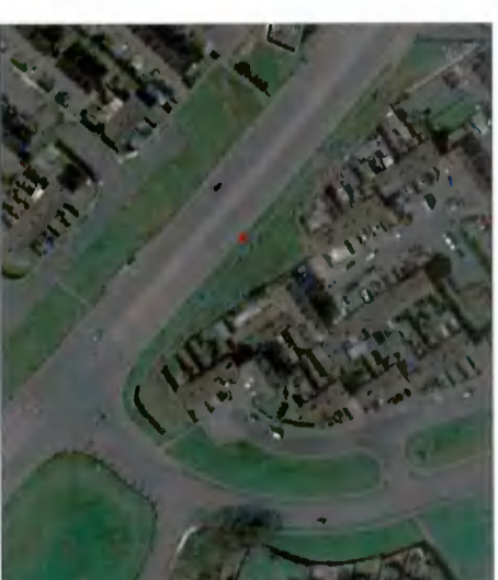
FIG. 3: EXISTING SATELLITE VIEW