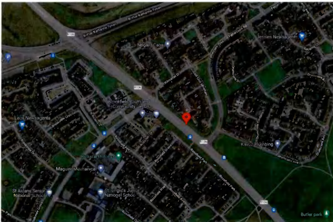
Figure 2; Satellite view of application site and surrounding area