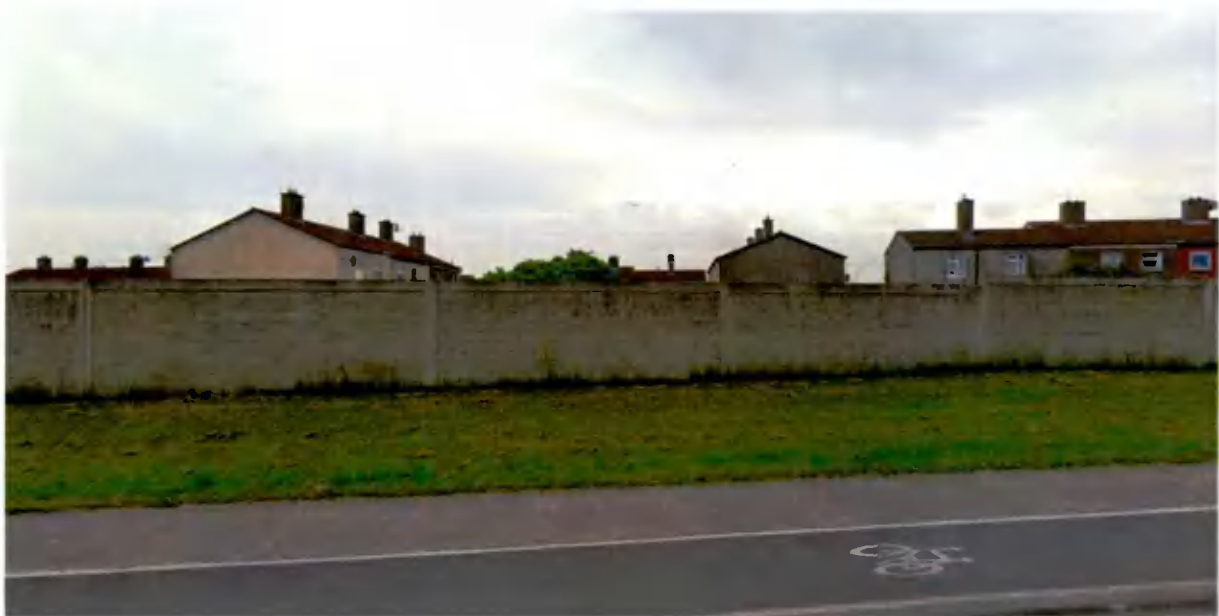
Figure 1; Streetview of application site