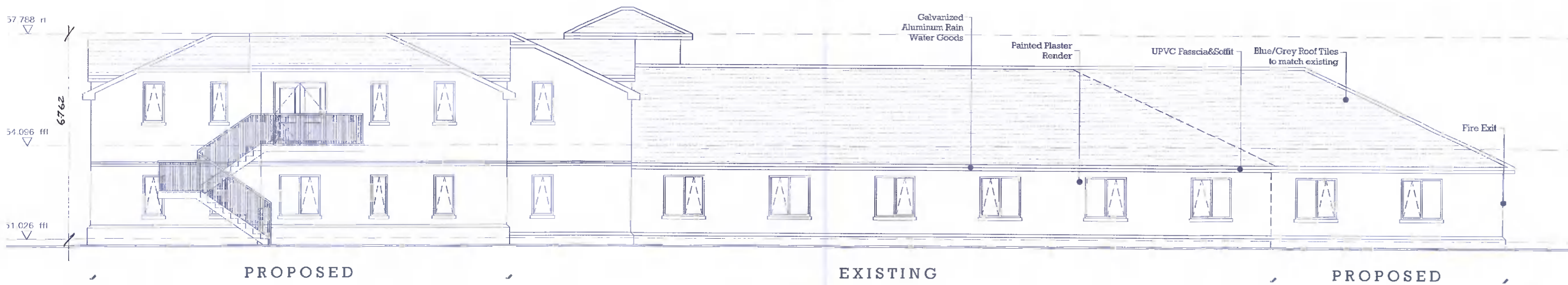
03 Previously Granted West Elevation (C) SCALE: 1:100