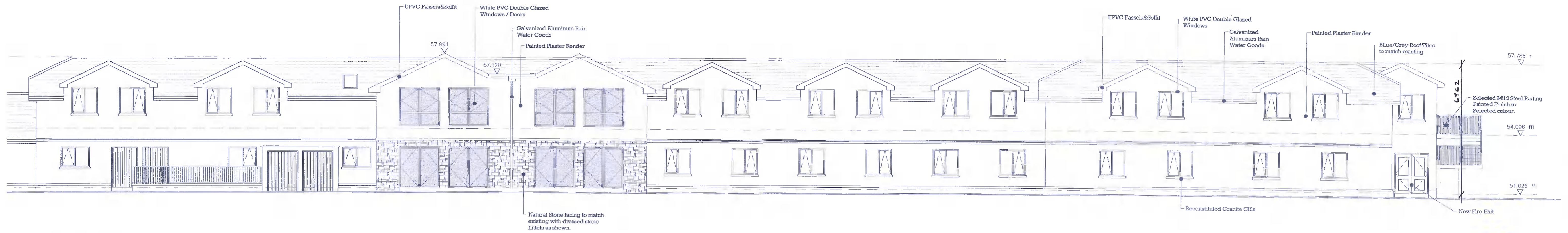
01 Previously Granted North Elevation (A) SCALE: 1:100