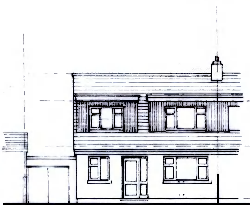
EXISTING SOUTH EAST ELEVATION