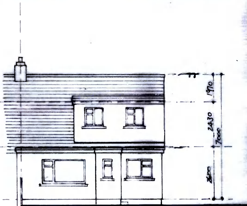
EXISTING NORTH WEST ELEVATION