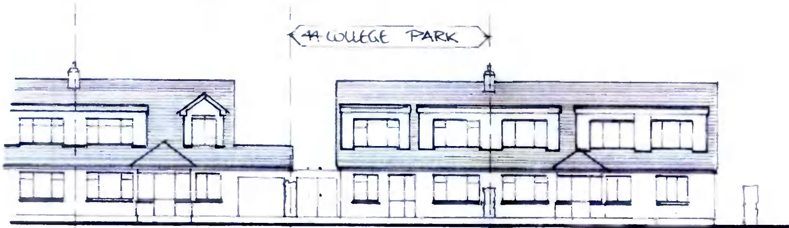
CONTIGUOUS ELEVATION - FRONT