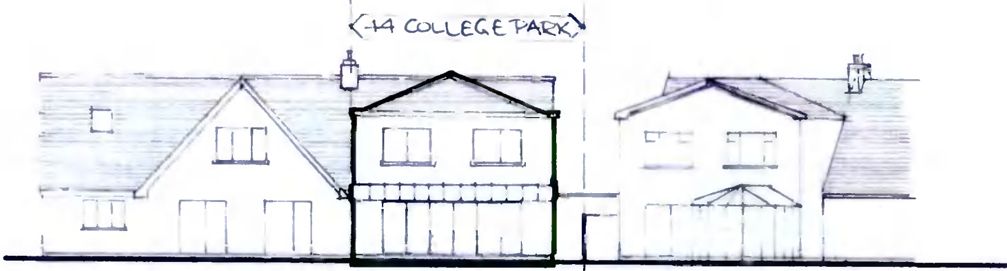
CONTIGUOUS ELEVATION - BACK

Email: pfergalryan@gmail.com TEL: 280 9823, MOBILE 086 2340396