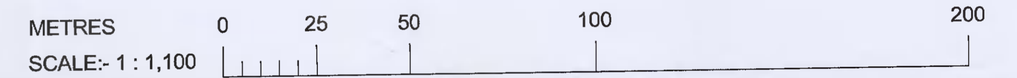
OS LOCATION PLAN (1000 SCALE)