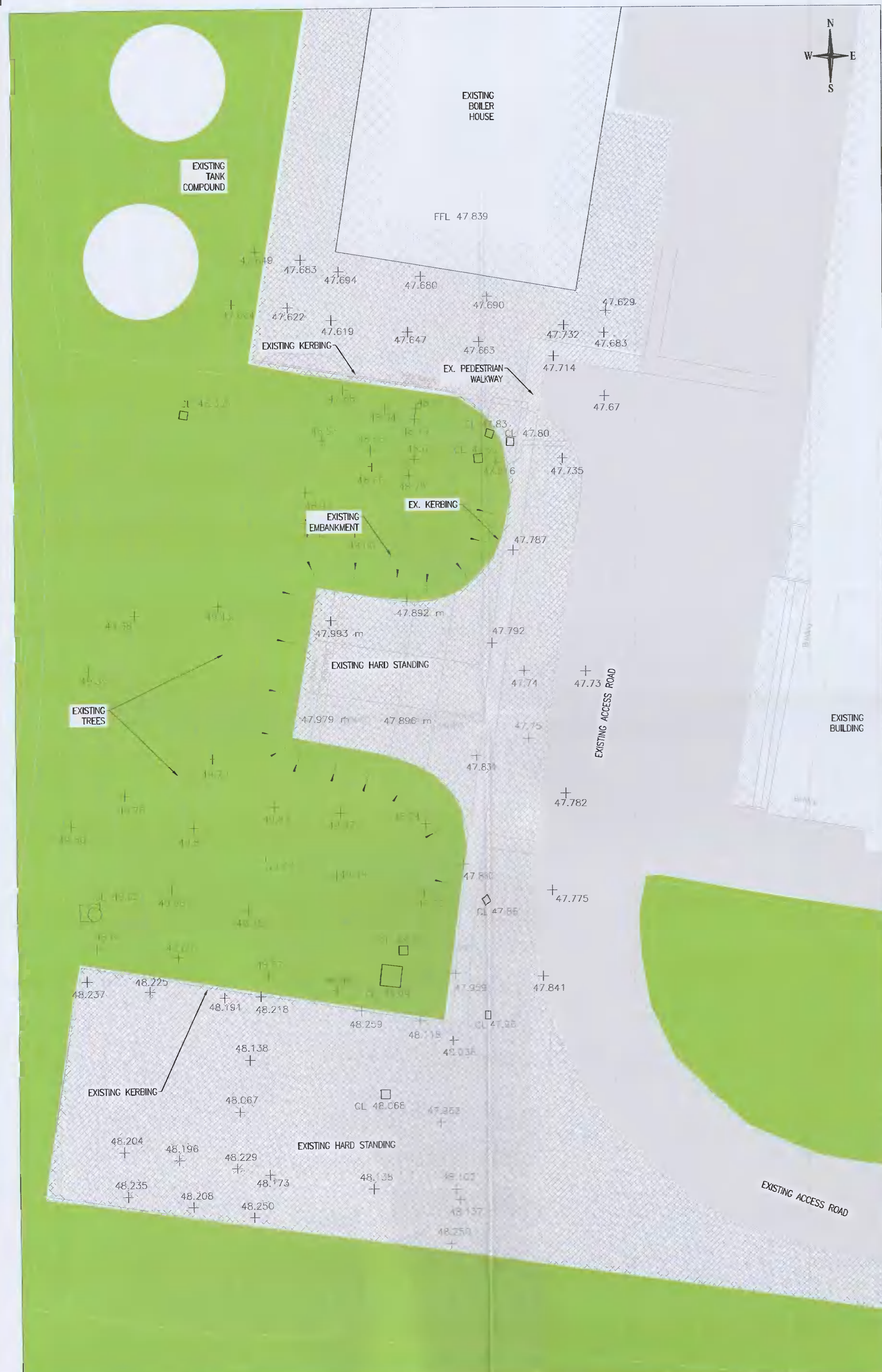
EXISTING SITE FINISHES - FLAVOUR WAREHOUSE SCALE 1:200