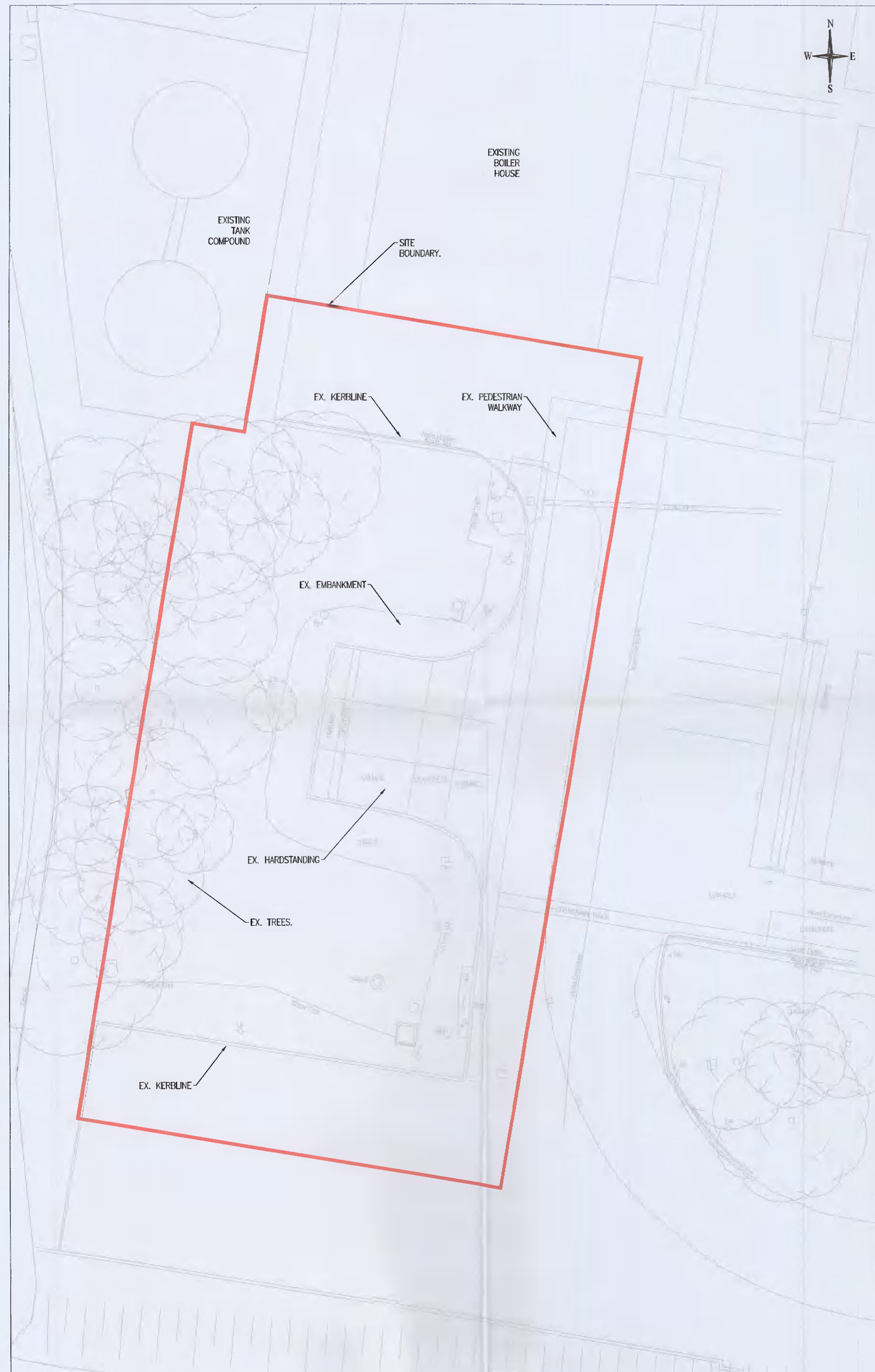
EXISTING SITE LAYOUT PLAN - FLAVOUR WAREHOUSE SCALE 1:200