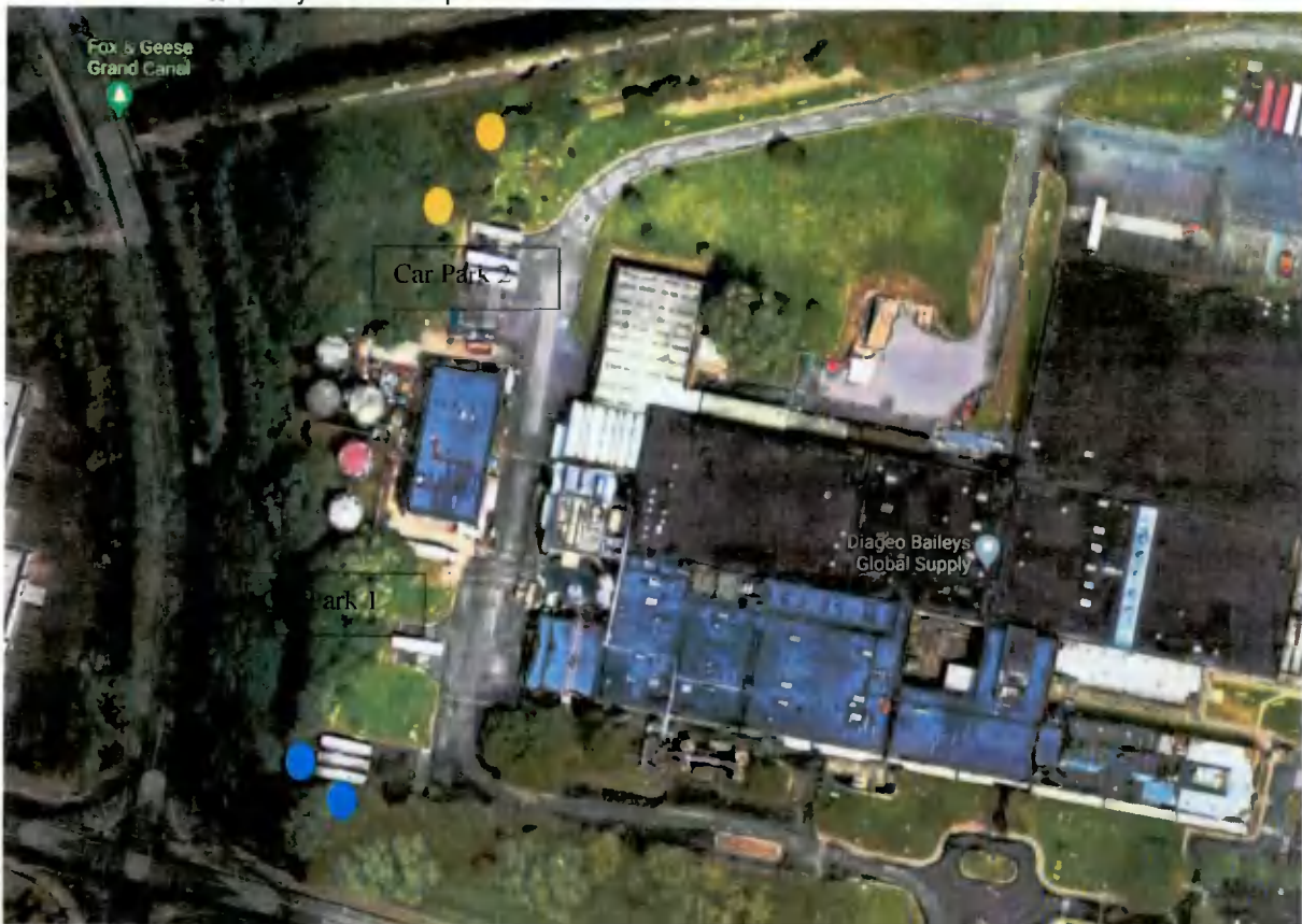
Map 1: Survey results: Orange = common pipistrelle, Blue = soprano pipistrelle (Car Parks 1 & 2).