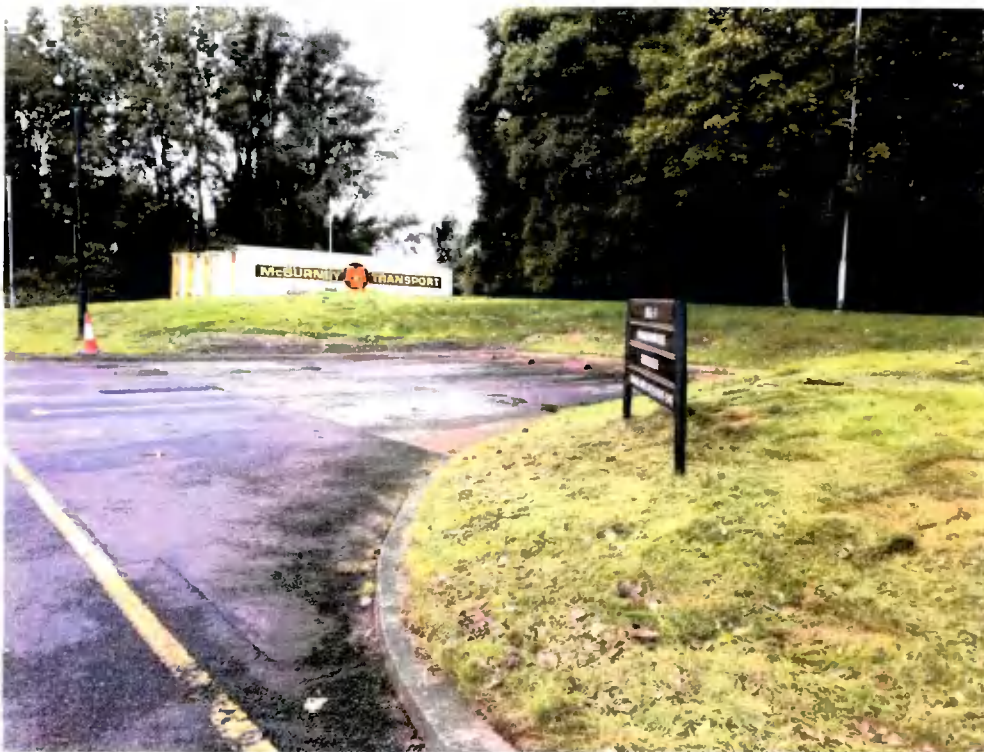
Figure 4: Site of proposed Bulk Store. Existing habitats are BL3 (Buildings and artificial surfaces) and GA2 (Amenity Grassland). Immature trees are adjacent to the site.