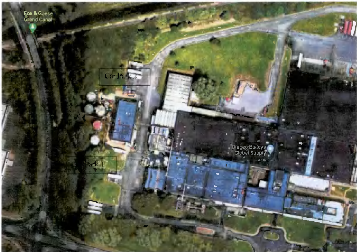
Map 1: Survey area (Car Parks 1 & 2).

10-15 minute stationary survey in car park 1, followed by a walking transect around car park 1 before walking to the next car park (car park 2), where 10-15 minute stationary survey was completed followed by a walk of the general vicinity this car park and adjacent habitat. This was repeated for the duration of the dusk survey.