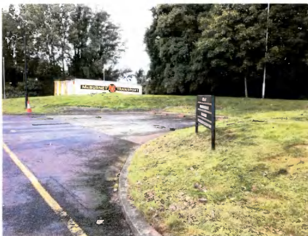
Figure 2: Site of proposed Bulk Store. Existing habitats are BL3 (Buildings and artificial surfaces) and GA2 (Amenity Grassland). Immature trees are adjacent to the site and are not included in the site footprint.