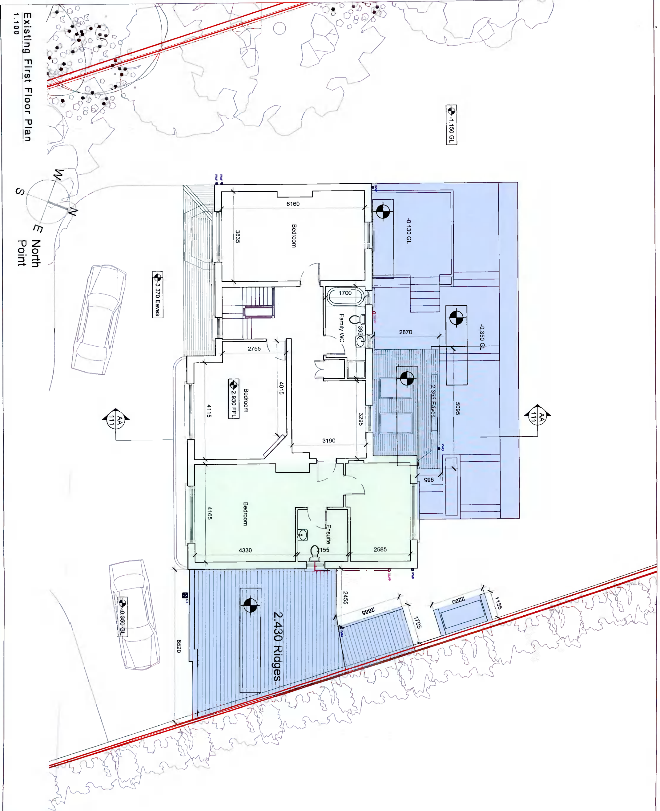
Existing First Floor Plan 1:100