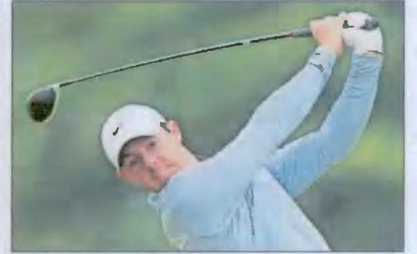
RANK 'N WHILE... ex-No 1 has been off the boil for some time