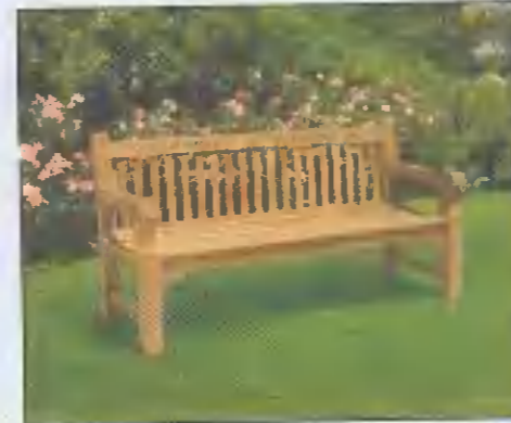
BENCH SEAT FOR ILLUSTRATION

Proposed Shrubs and Tree Planting to be carried out in the first planting season following completion of the site works