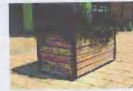
PLANTERS FOR ILLUSTRATION ONLY