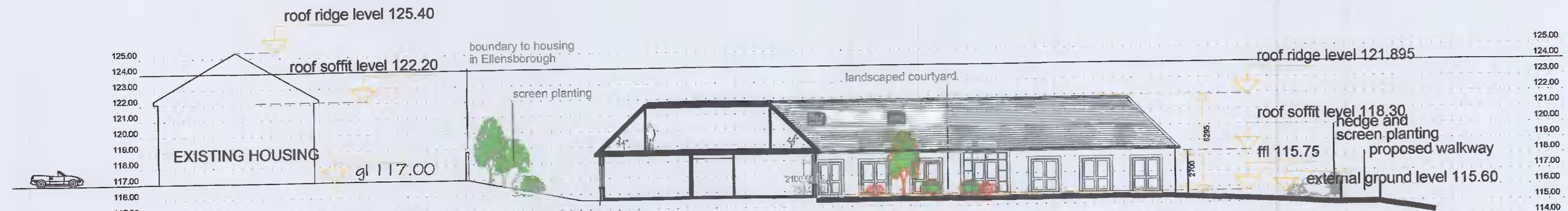
EXISTING SITE SECTION AND LEVELS