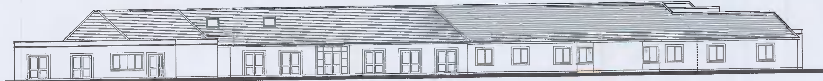
PROPOSED EXTENSION ELEVATION D