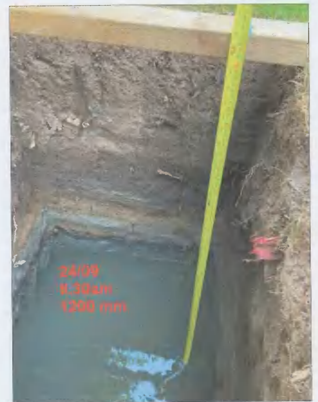
PERCOLATION TEST UNDERTAKEN 13-10-2021