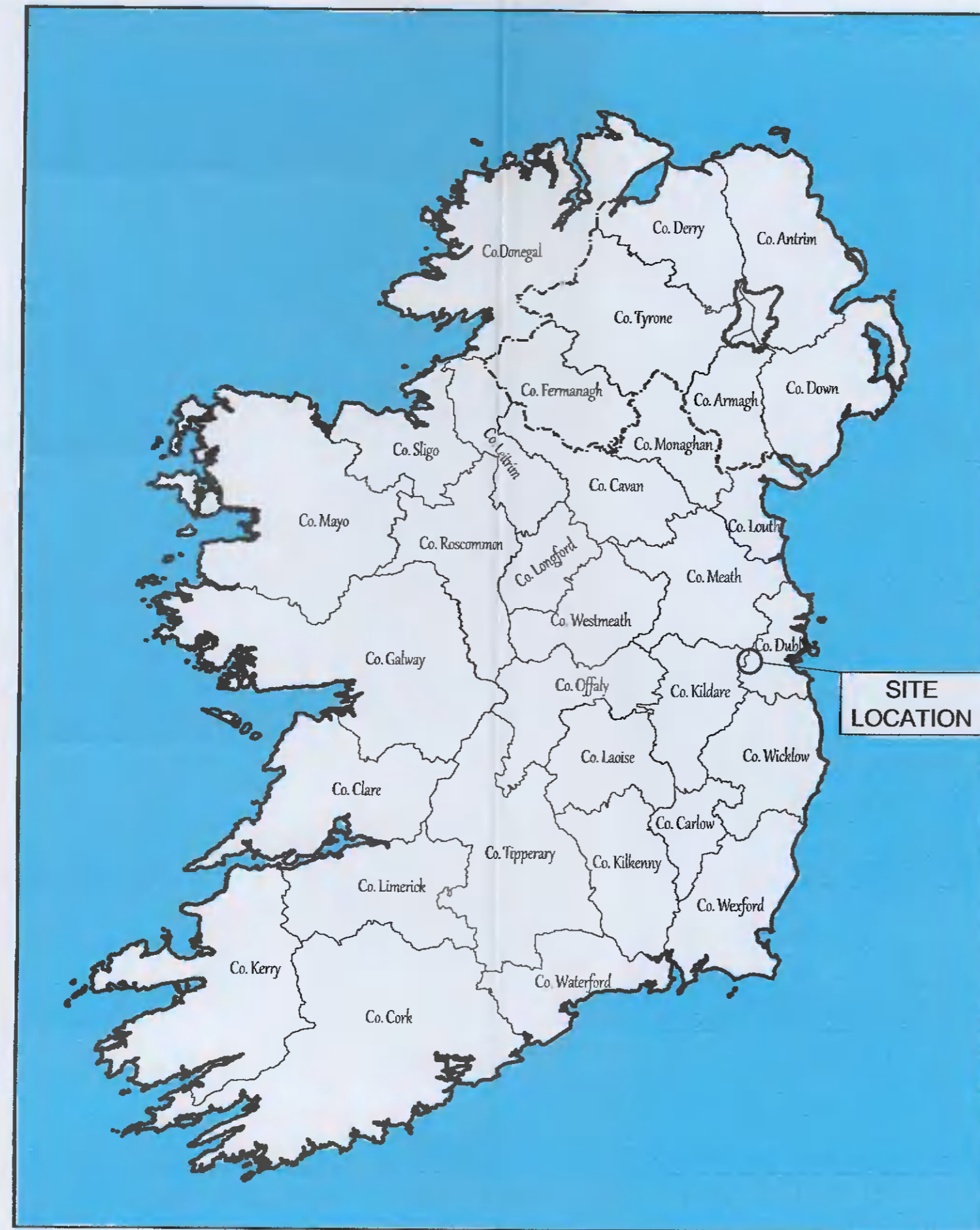
IRELAND LOCATION MAP Scale at A1 1:2,000,000 Scale at A3 1:4,000,000