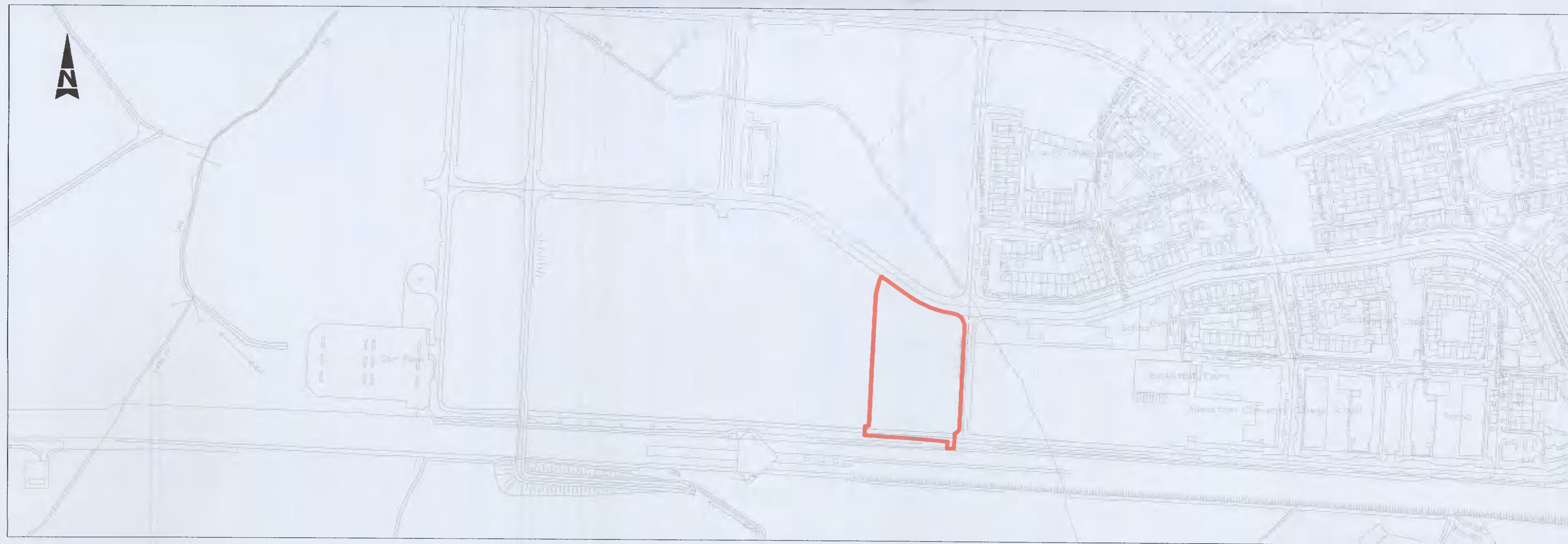
SITE PLAN - ADAMSTOWN DISTRICT CENTRE PHASE 2 BLOCK G Scale at A1 1:2,500 Scale at A3 1:5,000

© ORDNANCE SURVEY IRELAND LICENSE No. AR 0082521. ORDNANCE SURVEY IRELAND & GOVERNMENT OF IRELAND