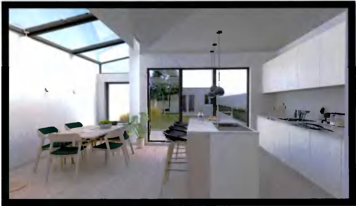
Figure 5 + 6 - INTERNAL VIEWS AND PROPOSED (REAR) GARDEN VIEW