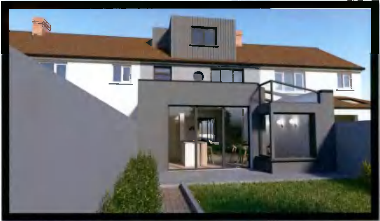
Figure 7 - PROPOSED (REAR) GARDEN VIEW FINISH TO BE A SMOOTH RENDER PLASTER FINISH RAL 7012 OR SIMILAR. PROPOSED TIMBER REVEALS AROUND THE PROPOSED WINDOW AND DOOR OPENS. PRESSED METAL PARAPET CAPPING AND CONCRETE SILL. WINDOWS AND DOORS TO BE CHARCOAL GREY OR SIMILAR. STANDING SEAM TROCAL CLADDING OR SIMILAR FOR THE DORMER WINDOW TO THE ROOF.