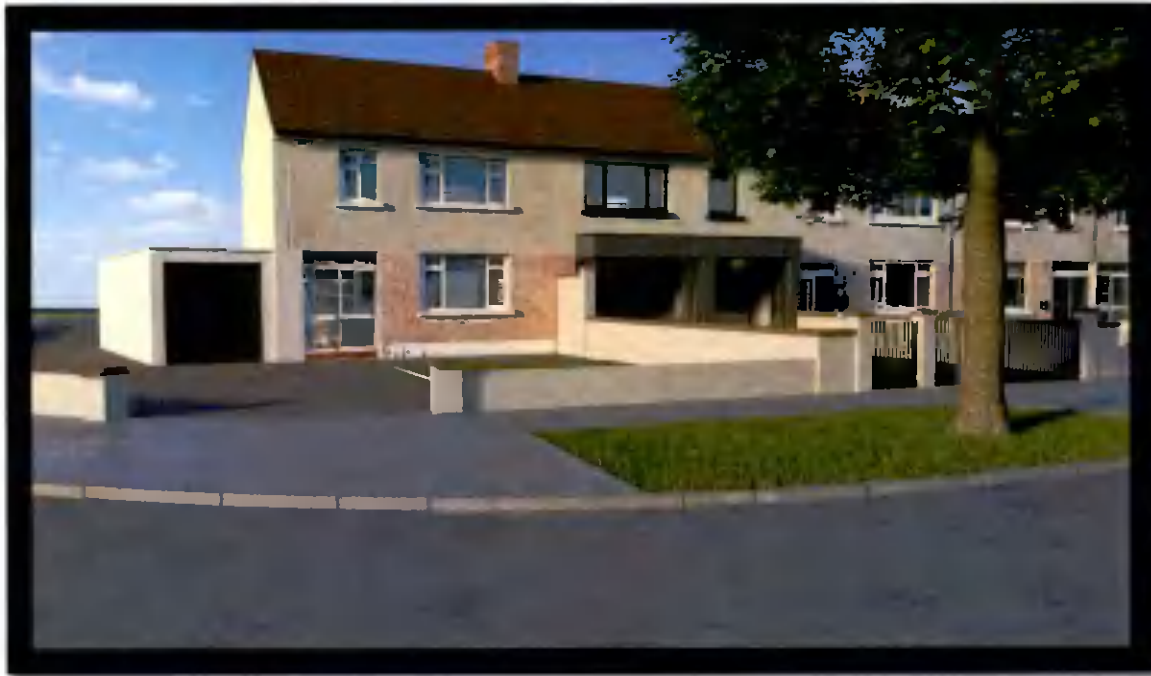
Figure 1 + 2

PROPOSED FRONT ELEVATION WITH NEW BAY WINDOW AND MAIN ENTRANCE. FINISH TO BE A SMOOTH RENDER PLASTER FINISH, RAL 7012 OR SIMILAR. PROPOSED TIMBER REVEALS AROUND THE PROPOSED WINDOW AND DOOR OPES. PRESSED METAL PARAPET CAPPING. WINDOWS AND DOORS TO BE CHARCOAL GREY OR SIMILAR