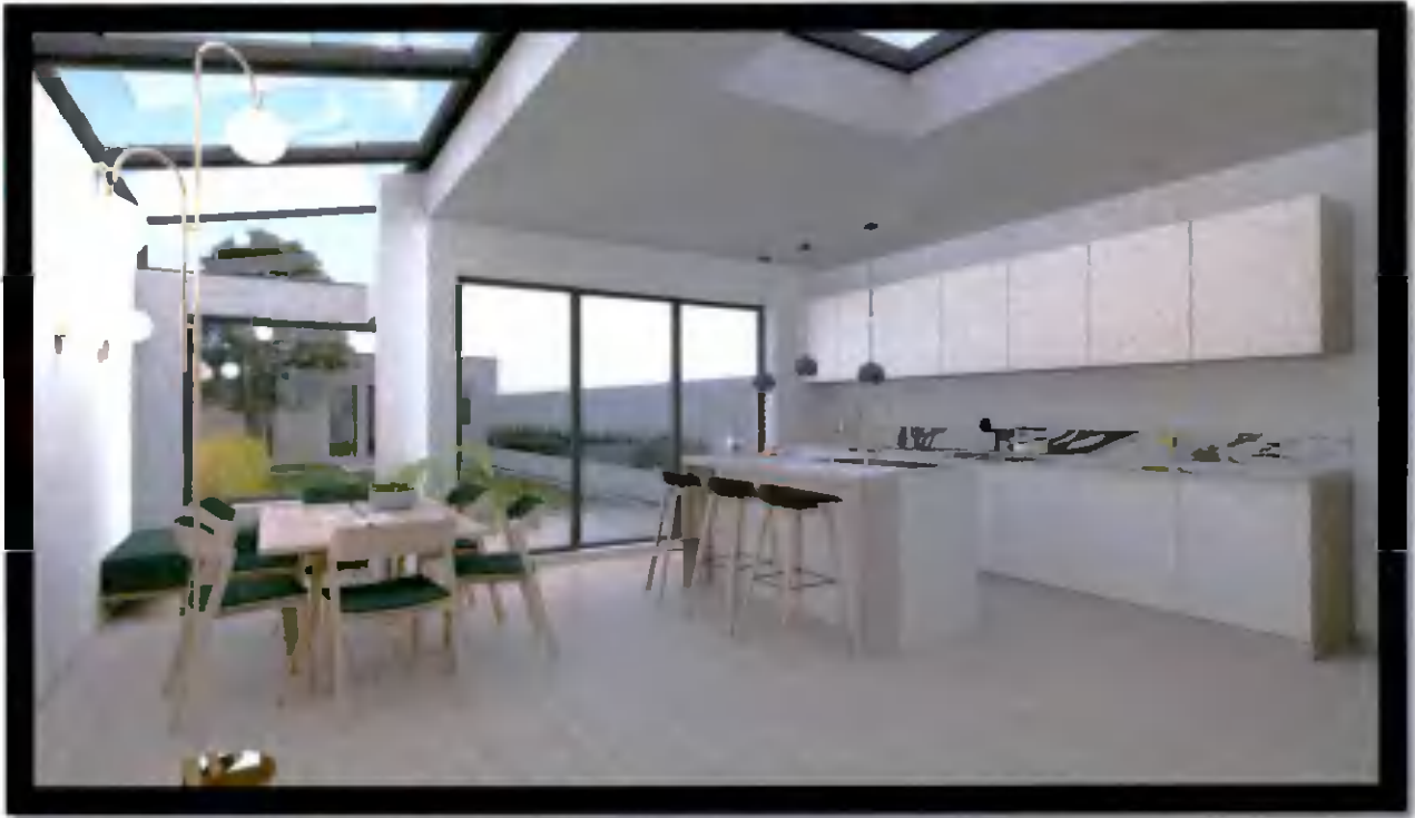
Figure 3 + 4 - INTERNAL VIEWS