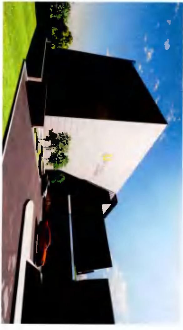
Giraffe Childcare Facing North-East