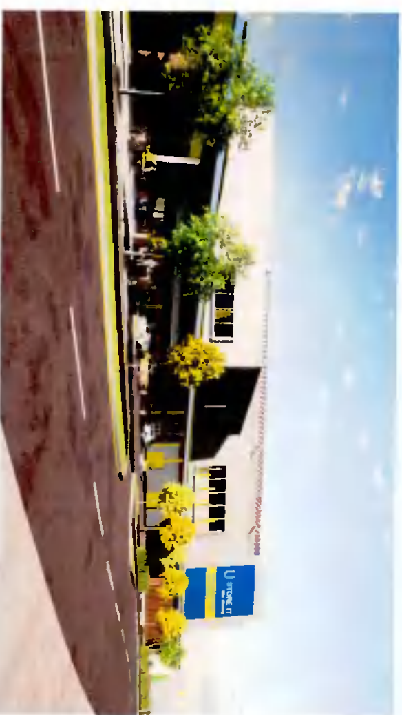
View from South