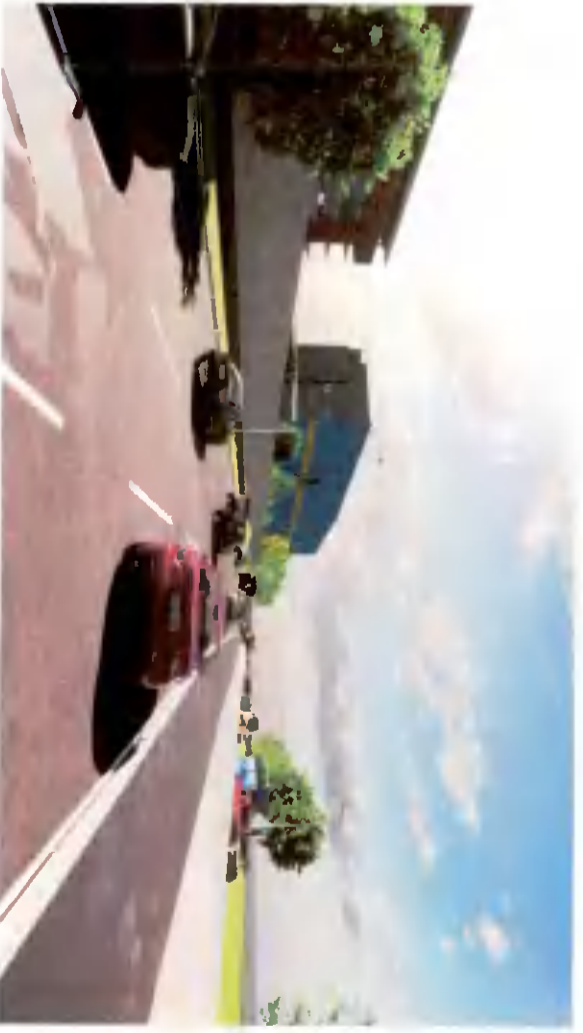
N4 Facing West