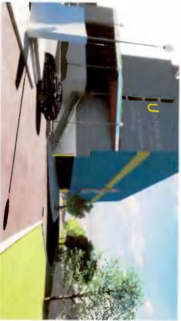
Basement Car Park Facing West