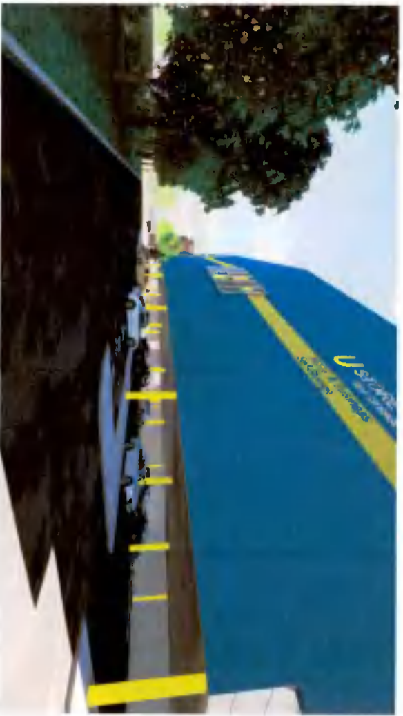
Basement Car Park Facing East