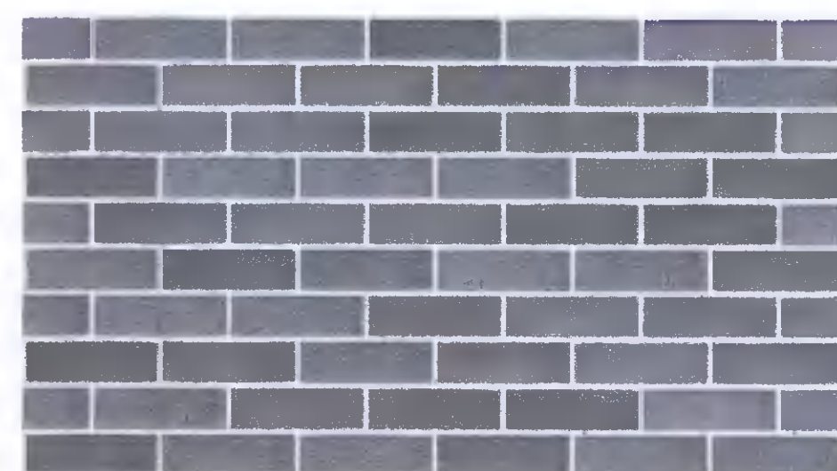
Black Brick or similar used for cladding of coffee shop

For drainage layouts and details refer to drawings/report by GDCL.