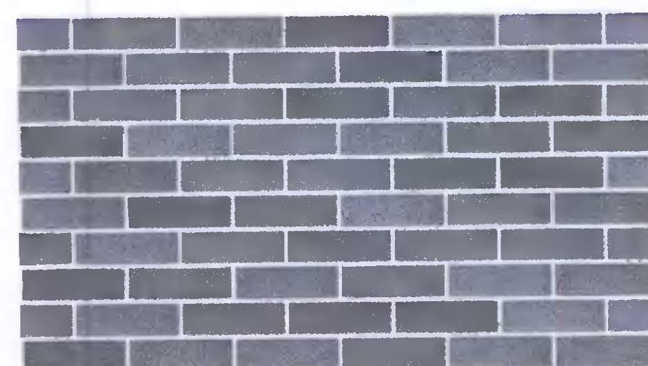
Black Brick or similar used for cladding of coffee shop

For drainage layouts and details refer to drawings/report by GDCL.