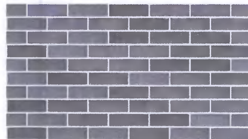
Black Brick or similar used for cladding of coffee shop

For drainage layouts and details refer to drawings/report by GDCL.