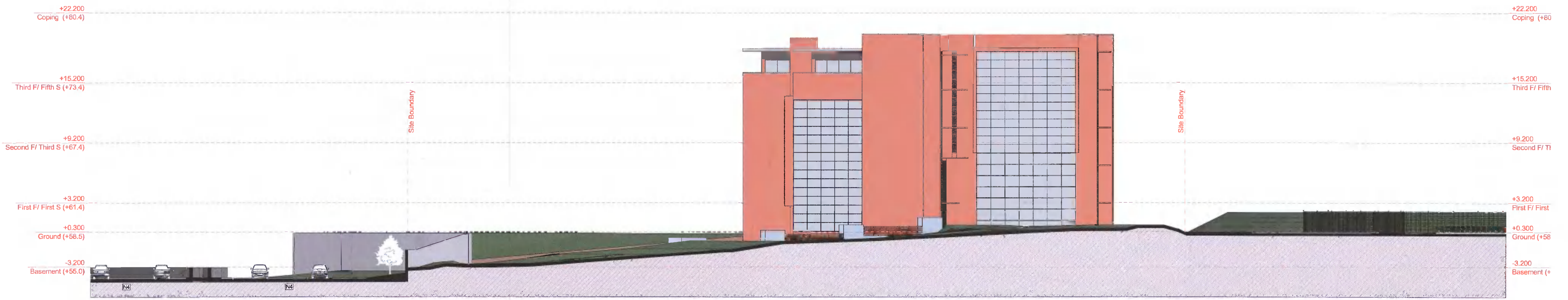
Proposed Section (Facing East) - 1:200