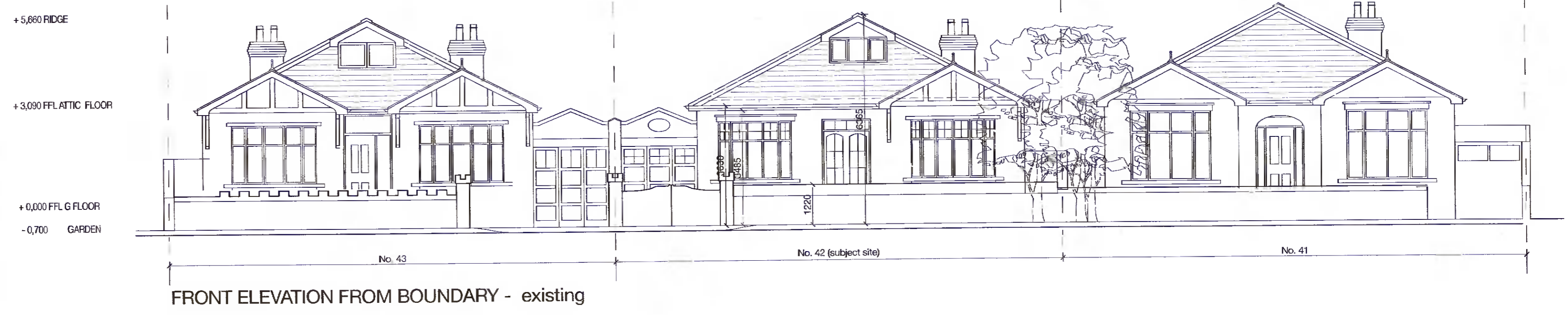
FRONT ELEVATION FROM BOUNDARY - existing