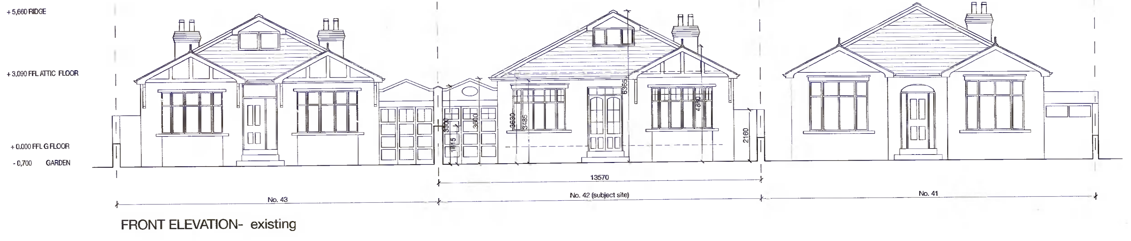
FRONT ELEVATION- existing