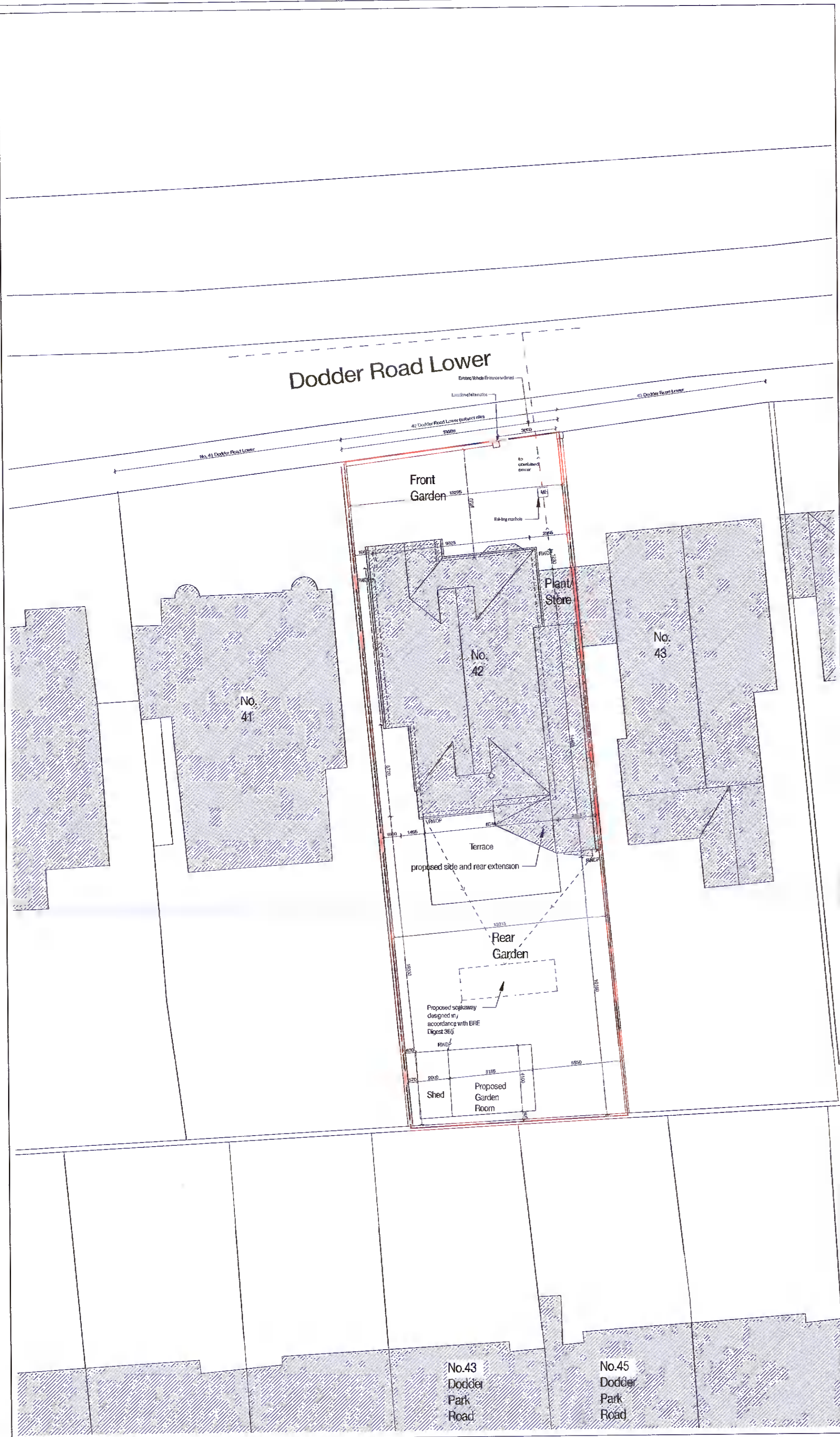
PROPOSED SITE PLAN - SCALE 1:200