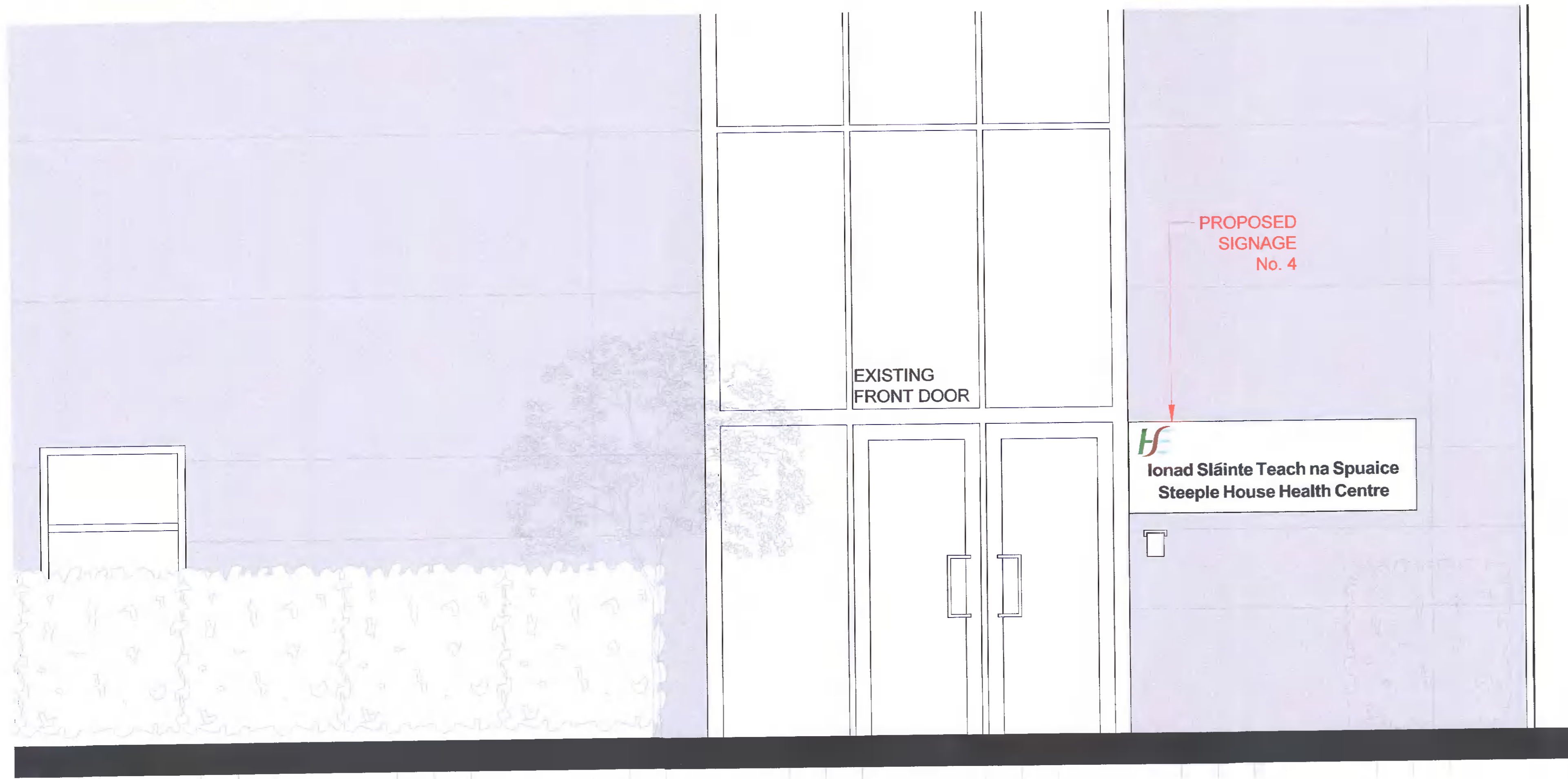
East Elevation Scale 1:20