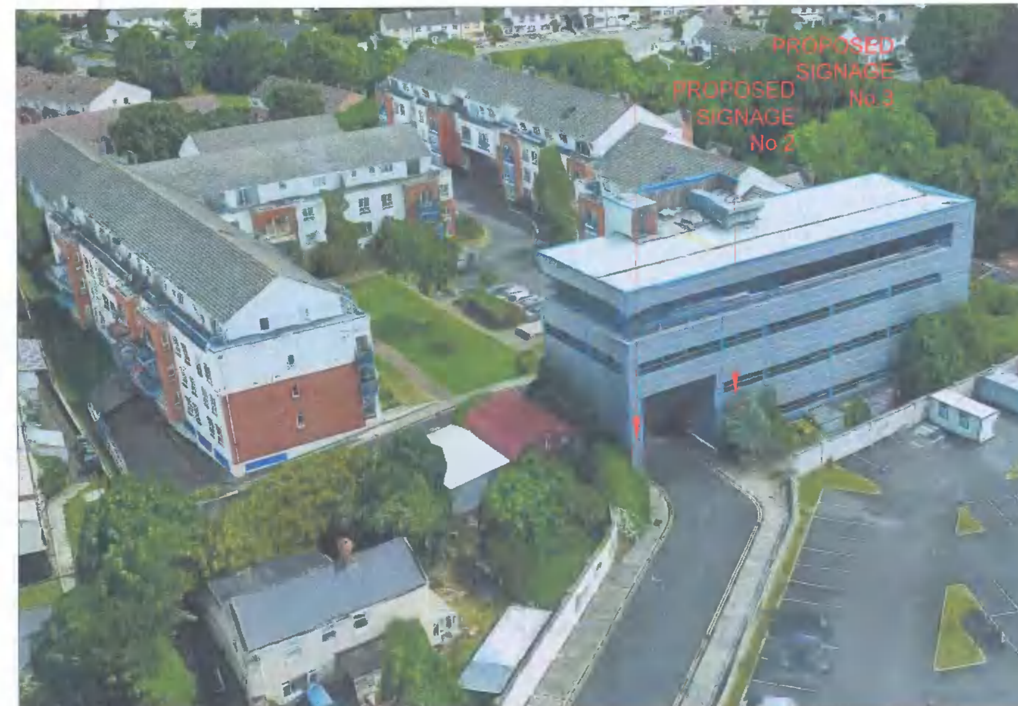
Photographs of existing (with intended location) Scale N/A