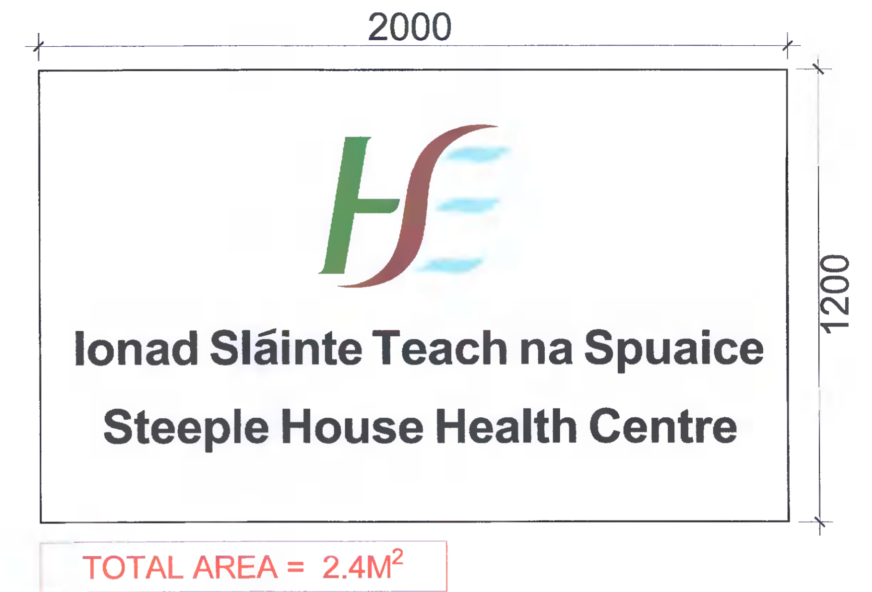
Signage No. 3 Dimensions Scale 1:10