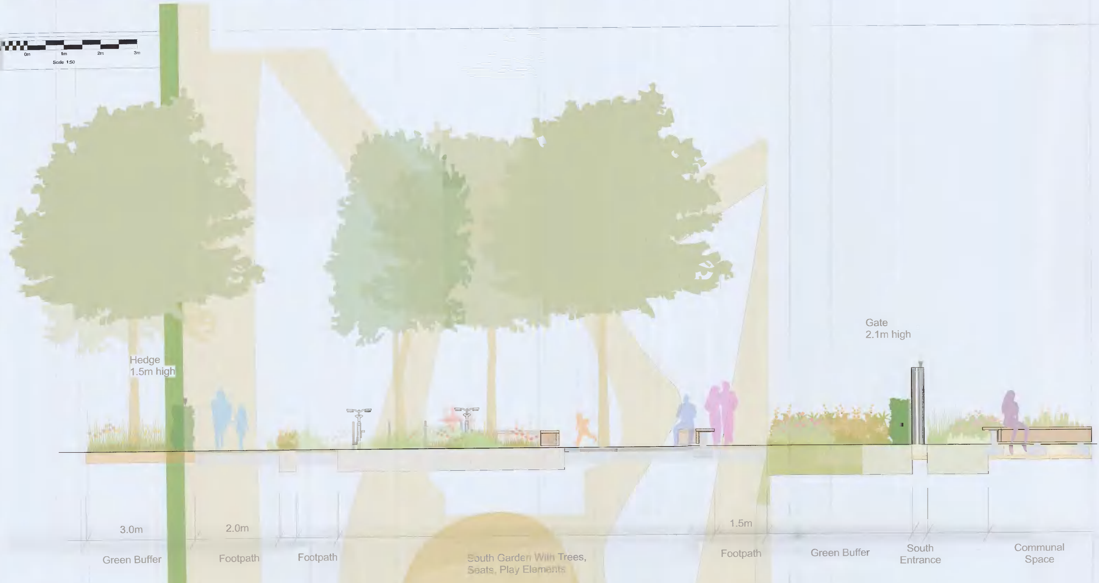
Section C Block G South Garden Section Scale 1:50 at A1