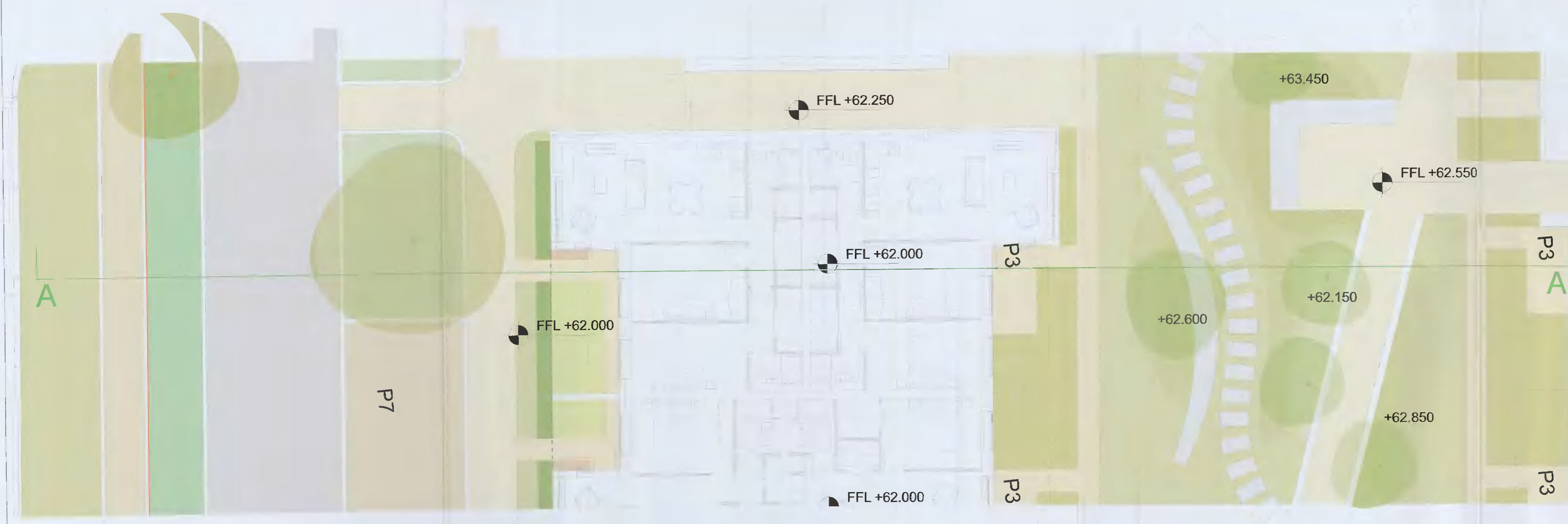
Section A Location Plan Block G Section Scale 1:100 at A1