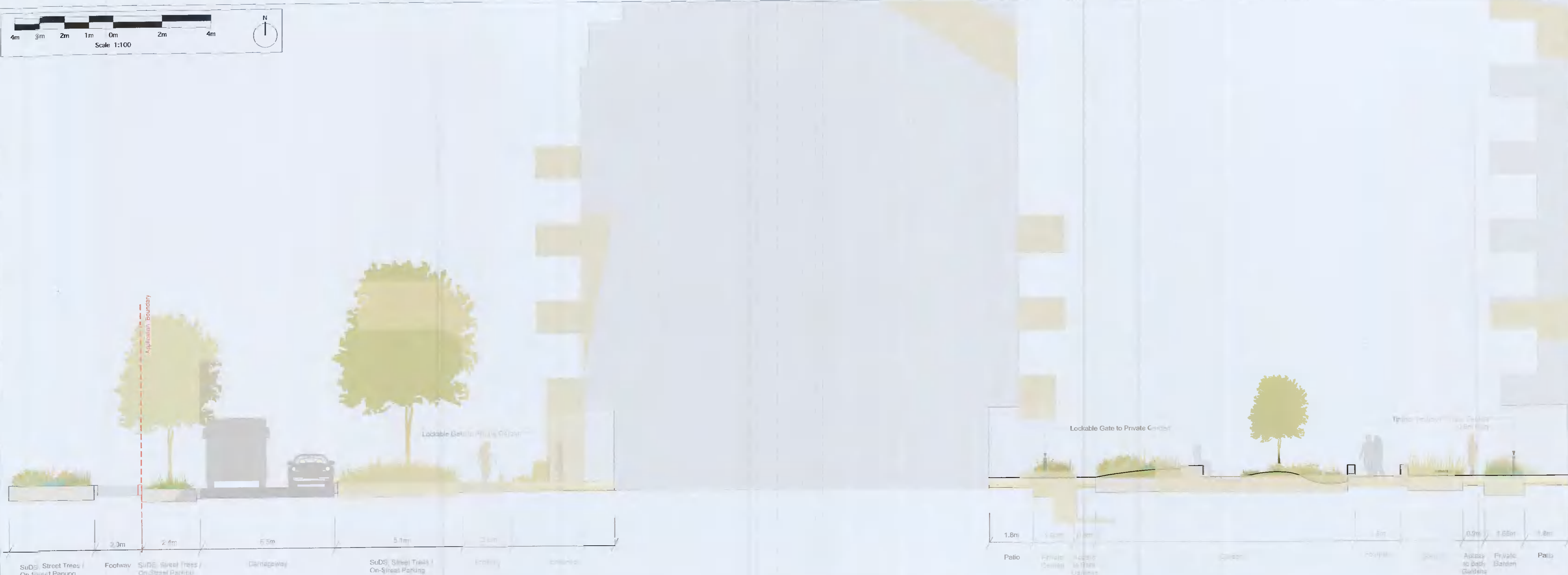
Section A Block G Section Scale 1:100 at A1