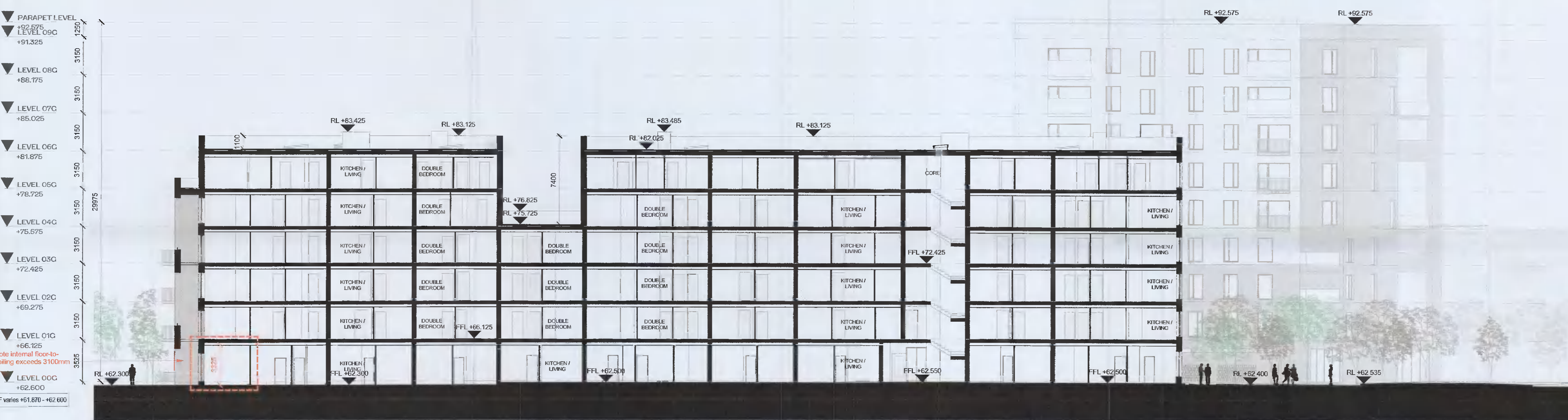
2 GA - SECTION - BB 1 : 200