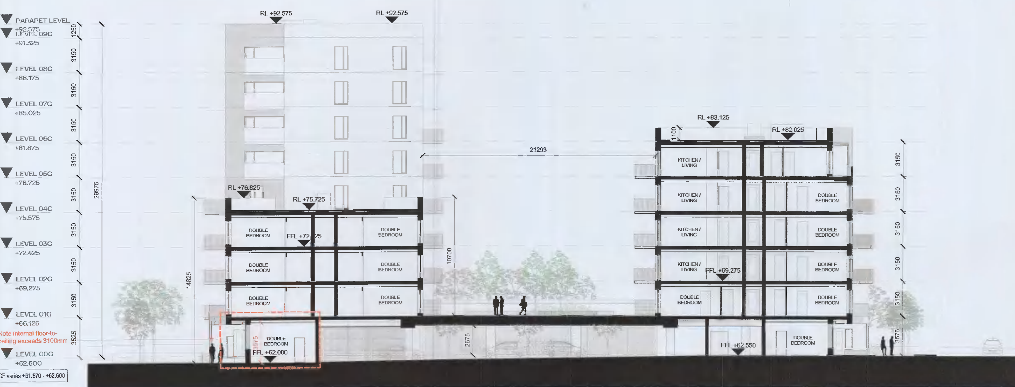
3 GA - SECTION - CC 1 : 200

AS PERMITTED UNDER REG. REF. SDZ21A/0007