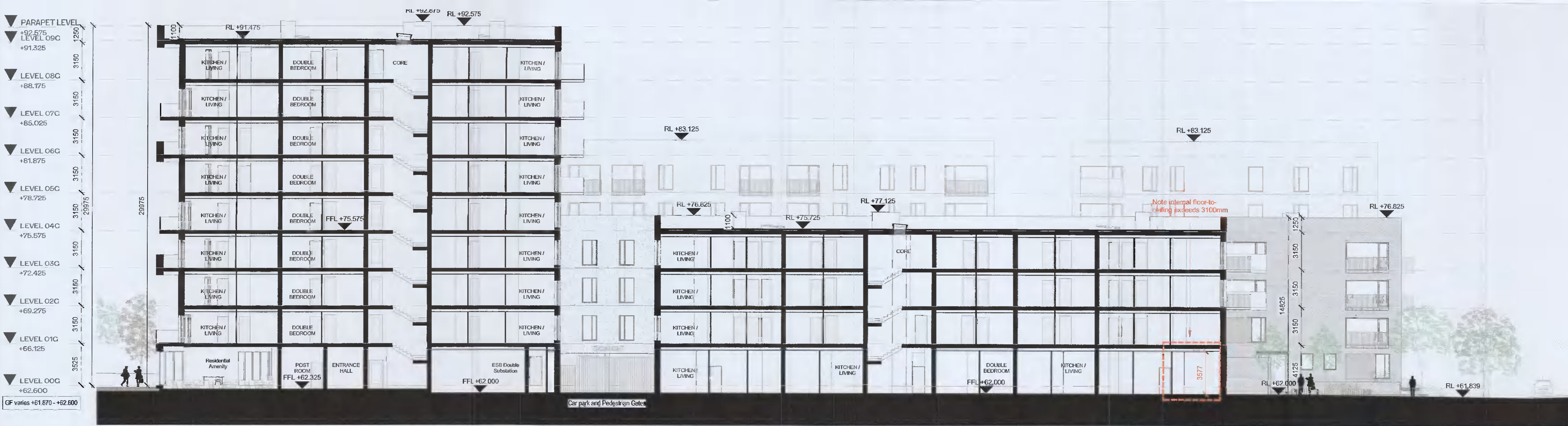
1 GA - SECTION - AA 1 : 200