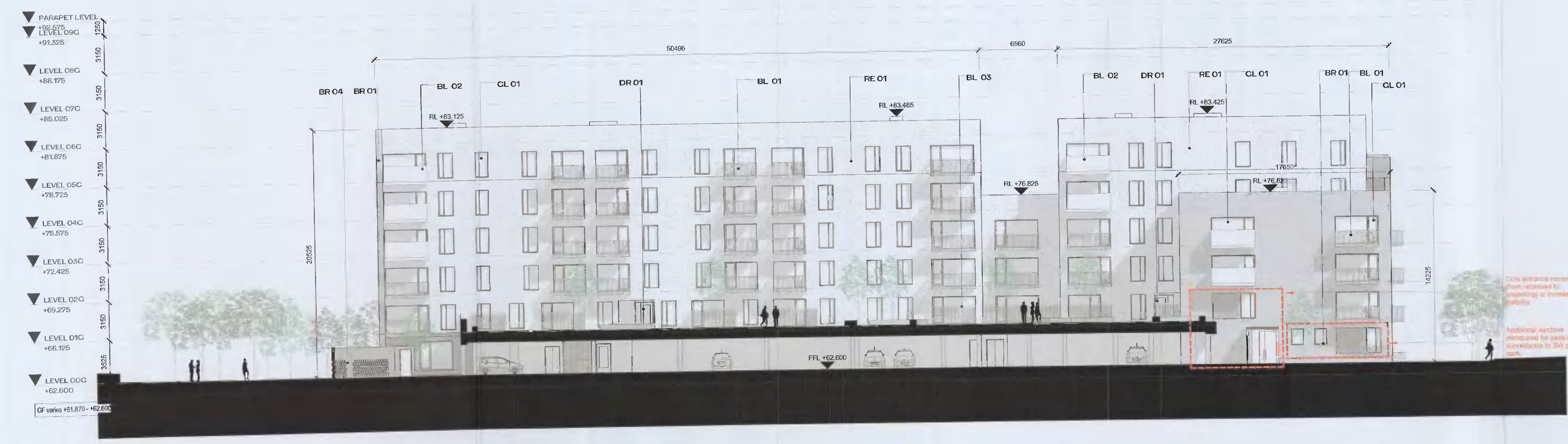
2 GA - ELEVATION - WEST - G2 1:200

Architecture + Interiors henryjlyons.com +353 1 898 3333 info@henryjlyons.com 51-54 Pearse Street Dublin D02 K406