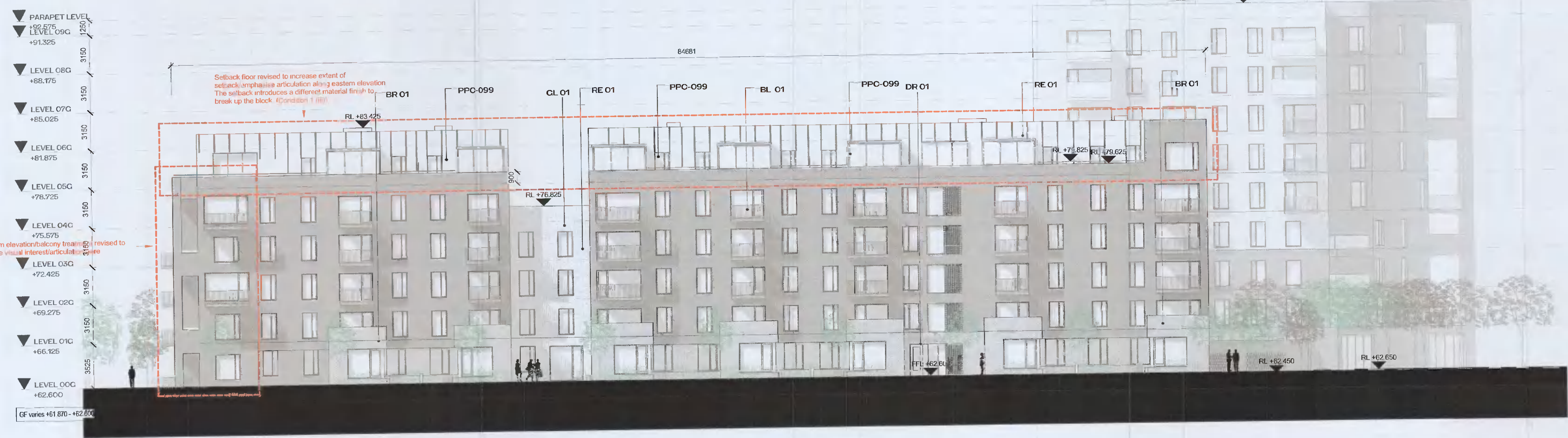
1 GA - ELEVATION - EAST - G2 1:200