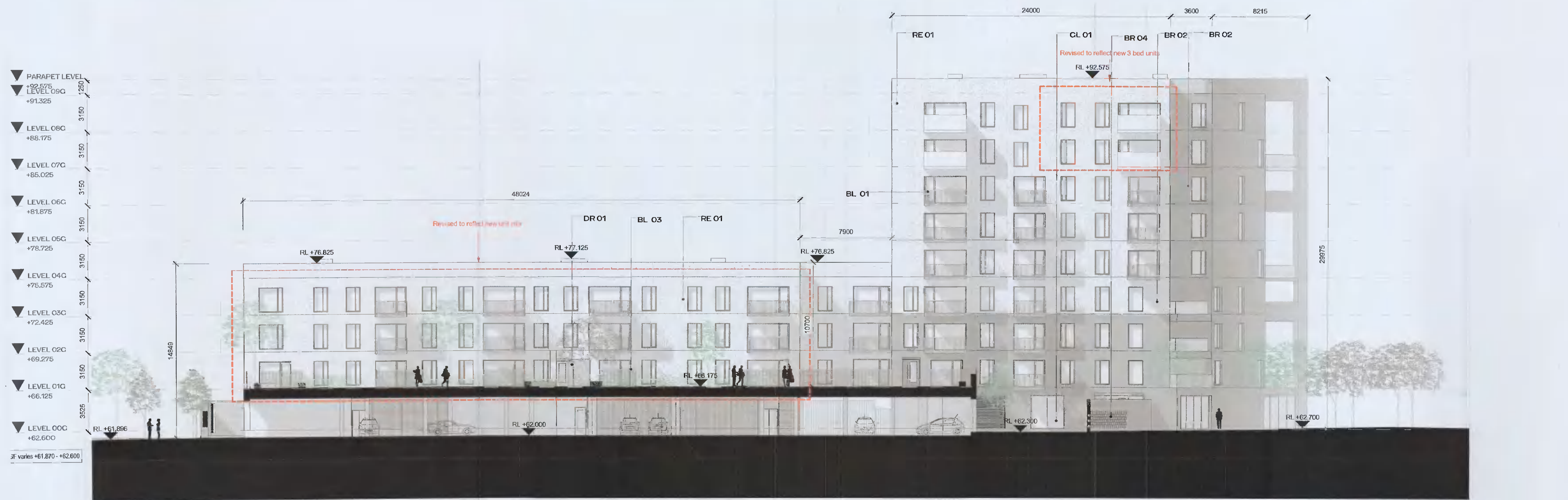
GA - ELEVATION - EAST - G1 1 : 200