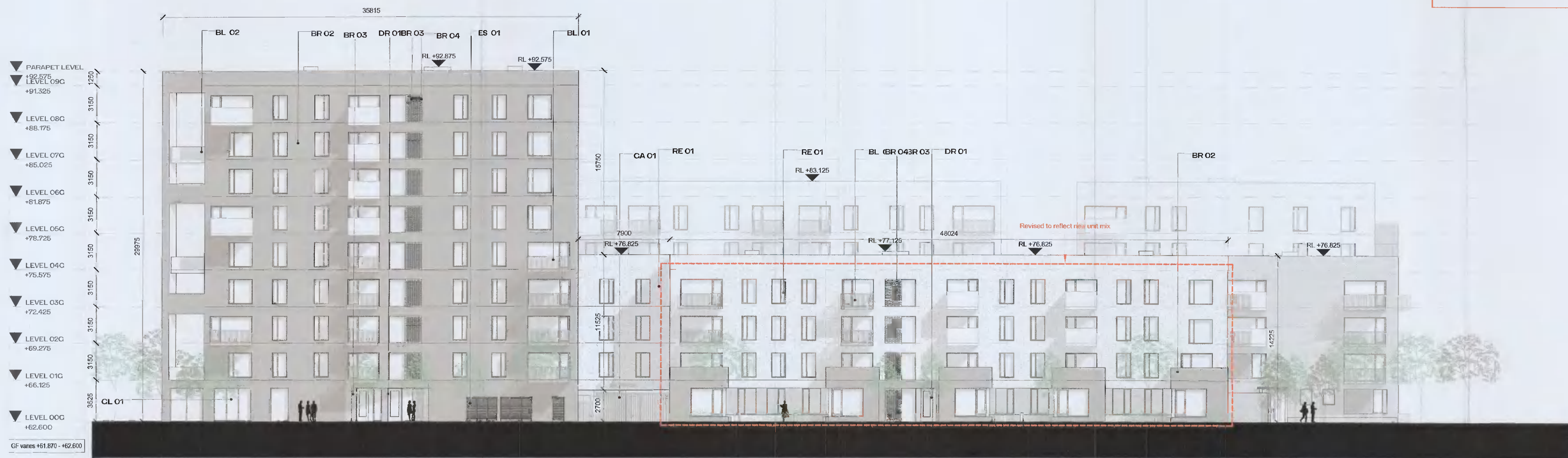
GA - ELEVATION - WEST - G1 1 : 200