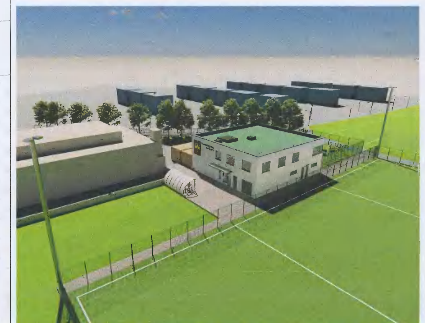
4 3-D Image A - Revised For Additional Information scale n/a