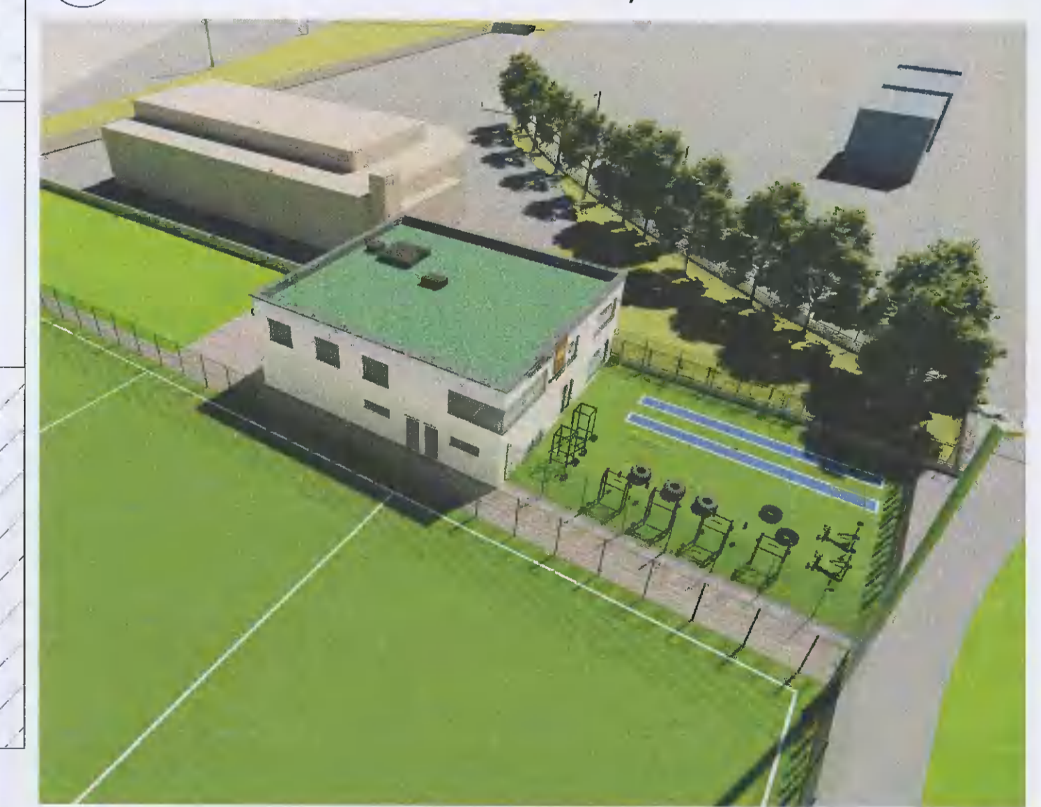
5 3-D Image B - Revised For Additional Information scale n/a

Proposed Site Plan; Proposed Site Sections; 3-D Images