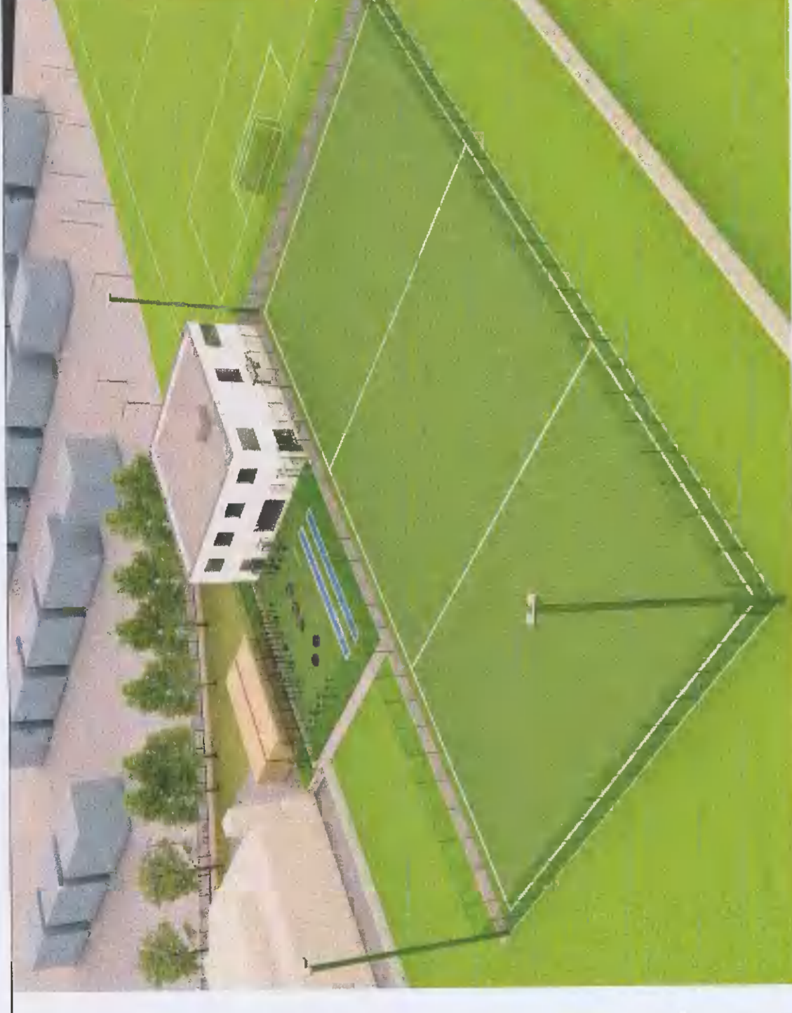
2 3-D Image A scale n/a