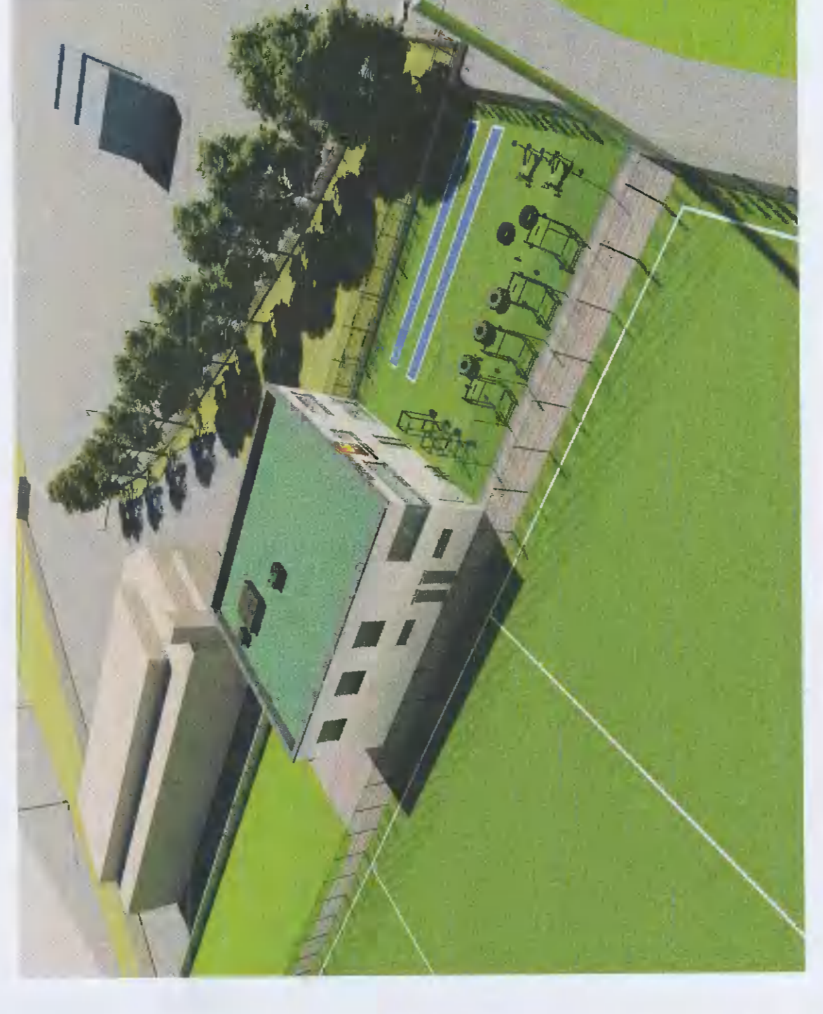
6 3-D Image D - Revised For Additional Information scale n/a