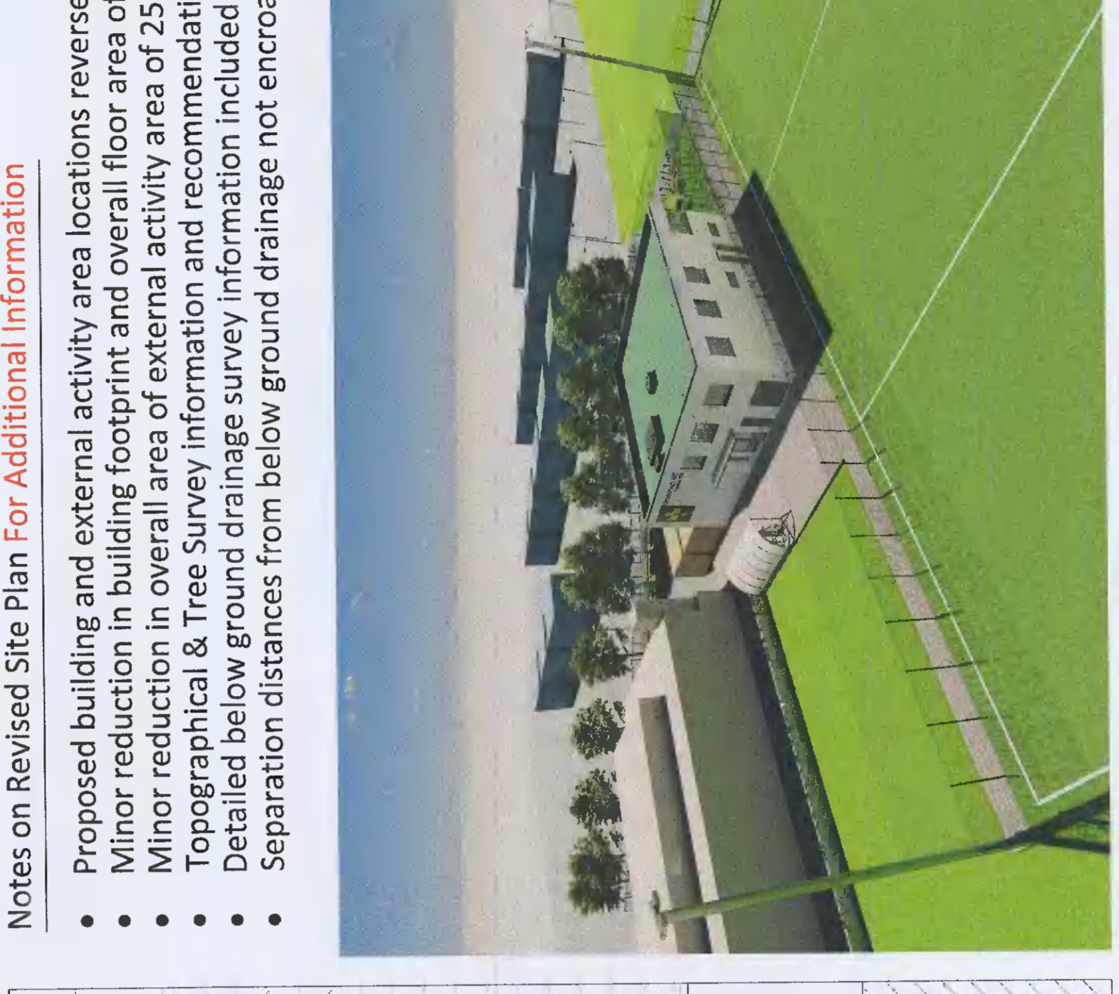
5 3-D Image C - Revised For Additional Information scale n/a