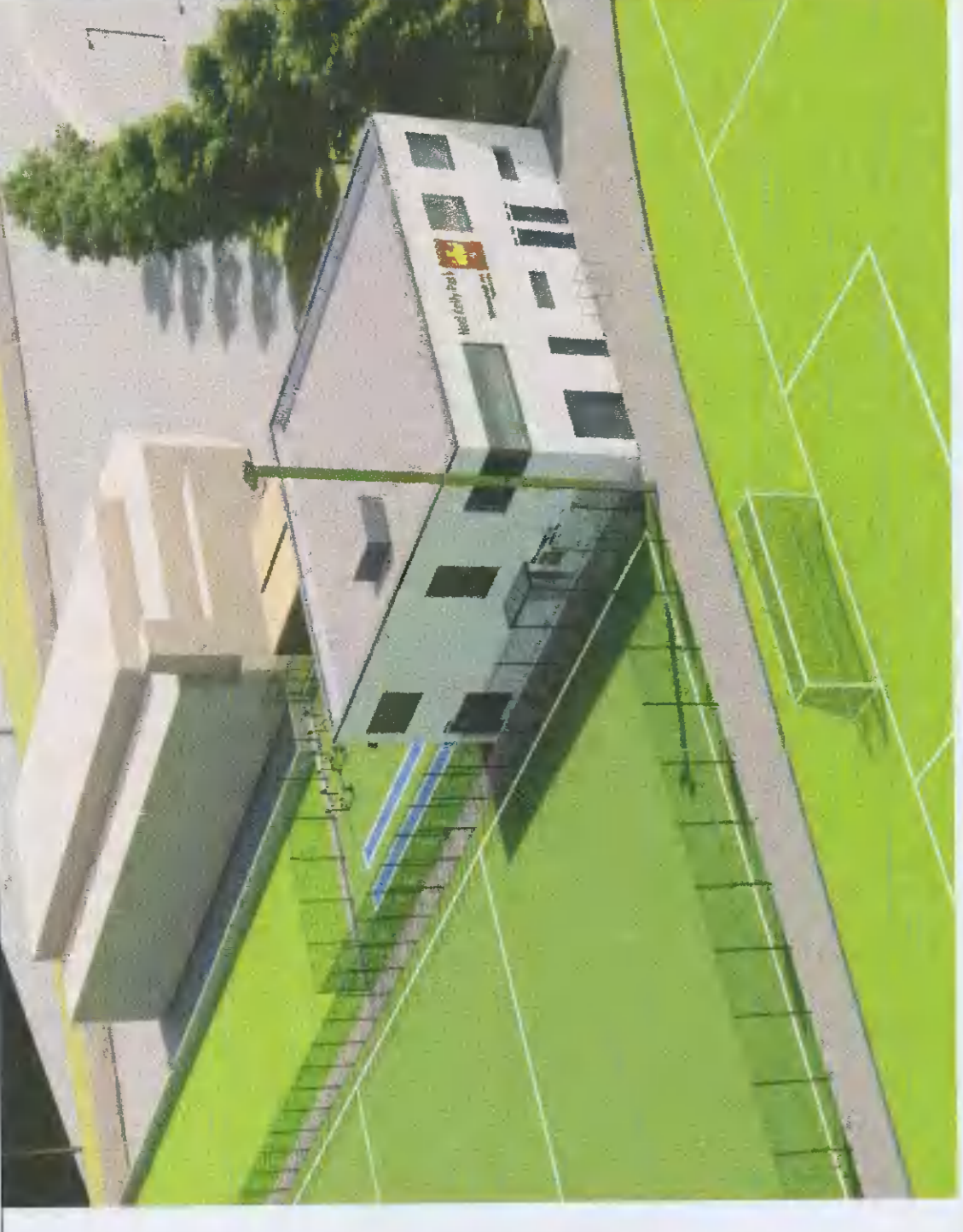
3 3-D Image B scale n/a