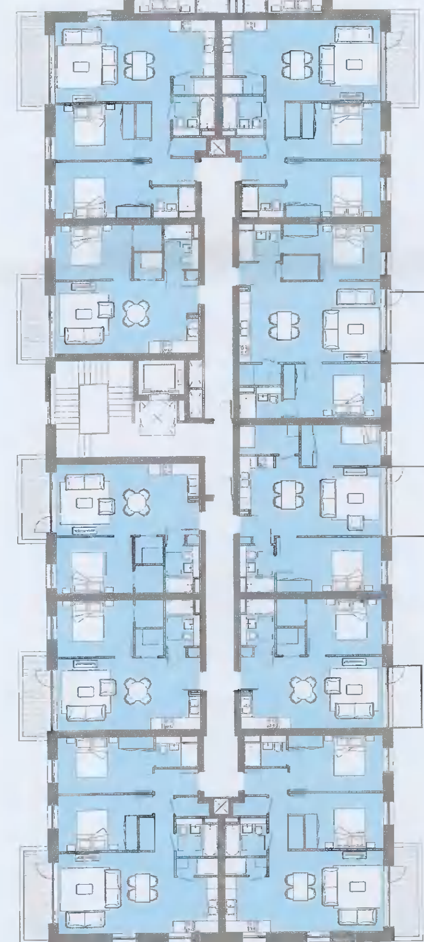
1 LEVEL 01G 1:200