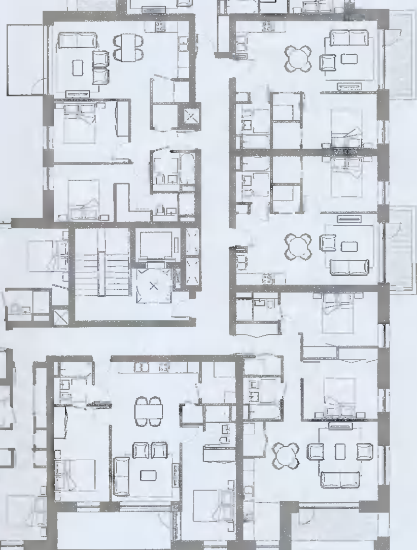
2 LEVEL 02G 1:200