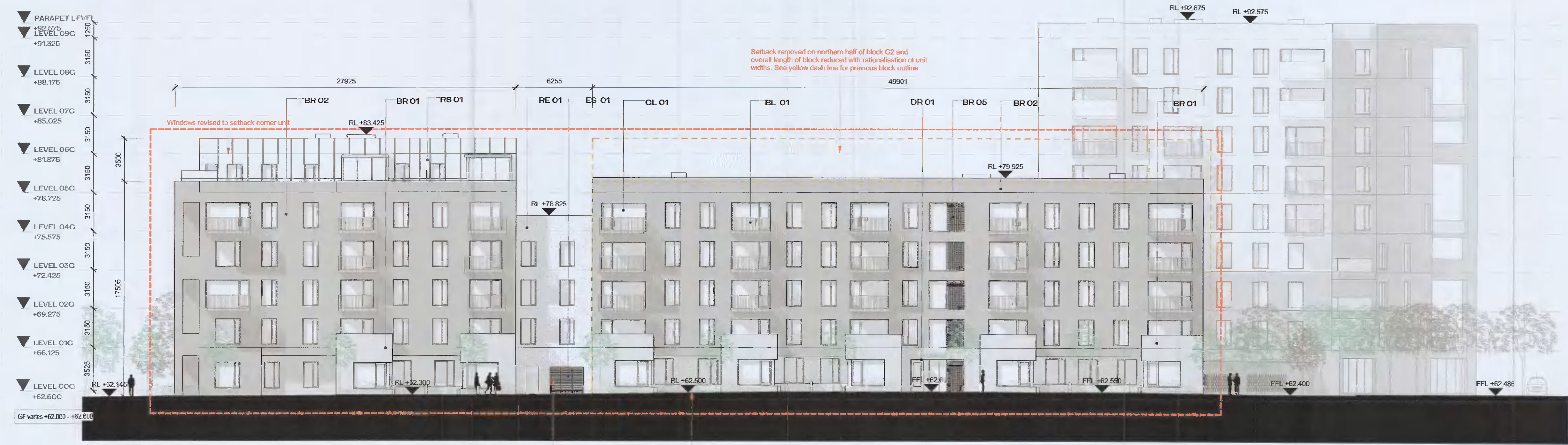
1 GA - ELEVATION - EAST - G2 1 : 200

H.L. Drawing Number on previously lodged planning application (SDZ21A/0007) ADC-HJL-G-ZZ-DR-A-2012 Revision (P02)