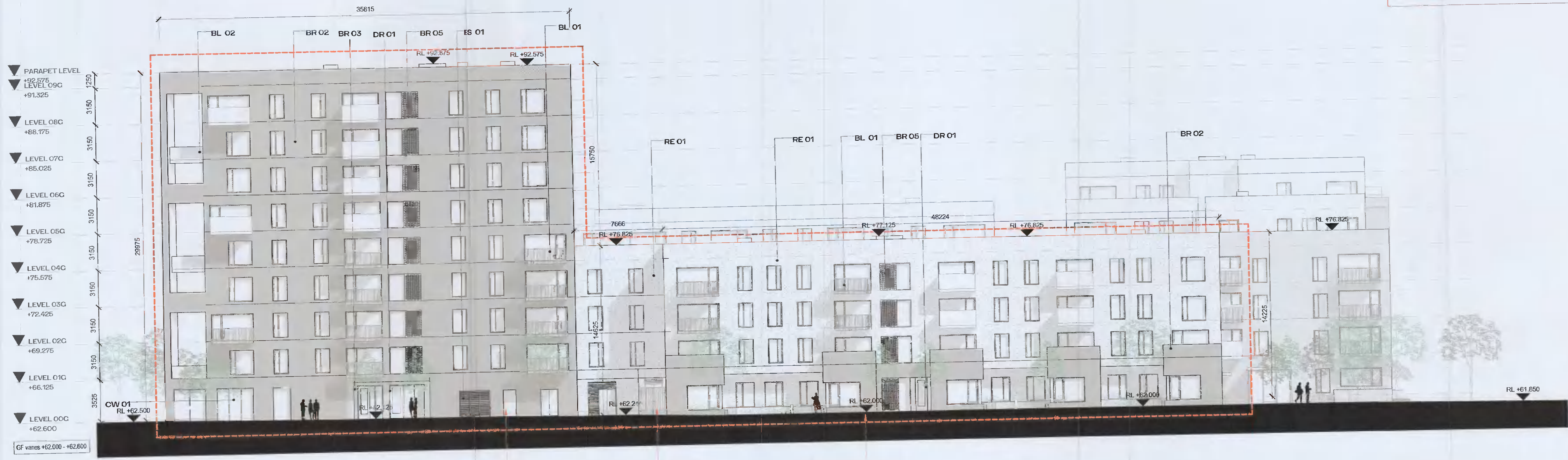
1 GA - ELEVATION - WEST - G1 1 : 200

Architecture + Interiors henryjlyons.com +353 1 888 3333 info@henryjlyons.com 51-54 Pearse Street Dublin D02 KA66