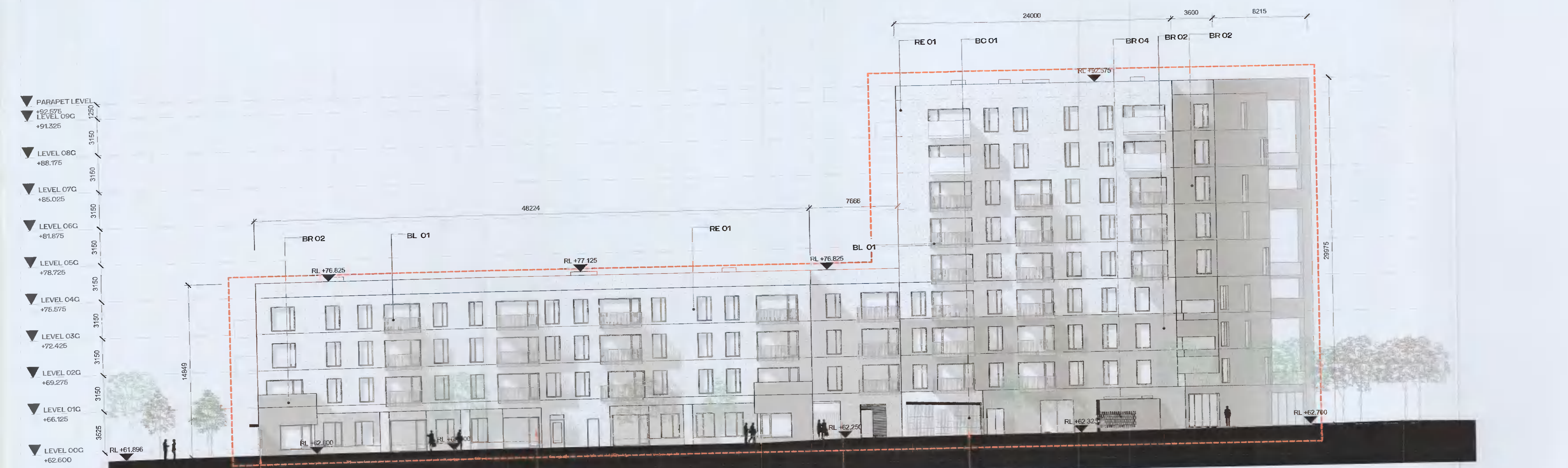
2 GA - ELEVATION - EAST - G1 1 : 200