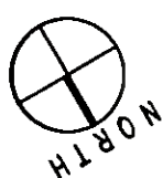
Proposed Site Layout Plan Scale: 1:200 @ A3

SITE PLANS BASED ON OS MAP | LICENCE NO: 50221896 | 3392-11 | DN018, DN022 | X,Y= 712072.77,729477.3