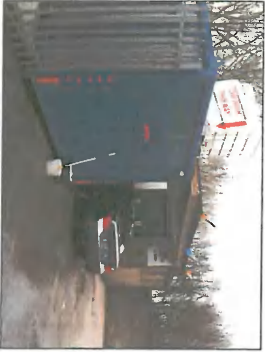
PH2 PORTACABIN OFFICE/CAR WASH AREA