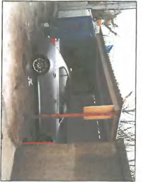
PH1 PORTACABIN OFFICE/CAR WASH AREA