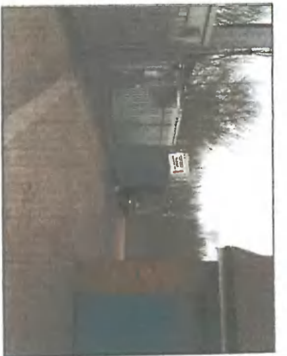
PH3 ACCESS TO CAR WASH AREA