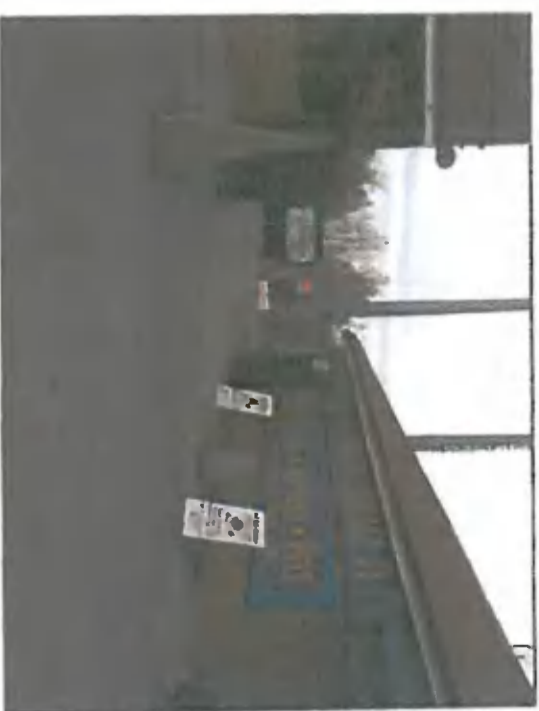
PH4 ENTRANCE TO CAR WASH AREA